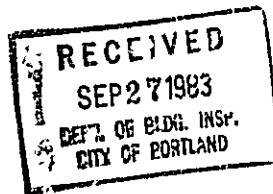
Chart. 84 B-2