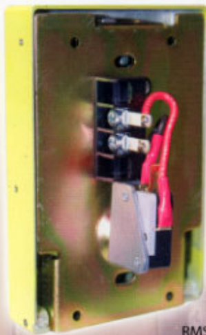
RMS IT Shown