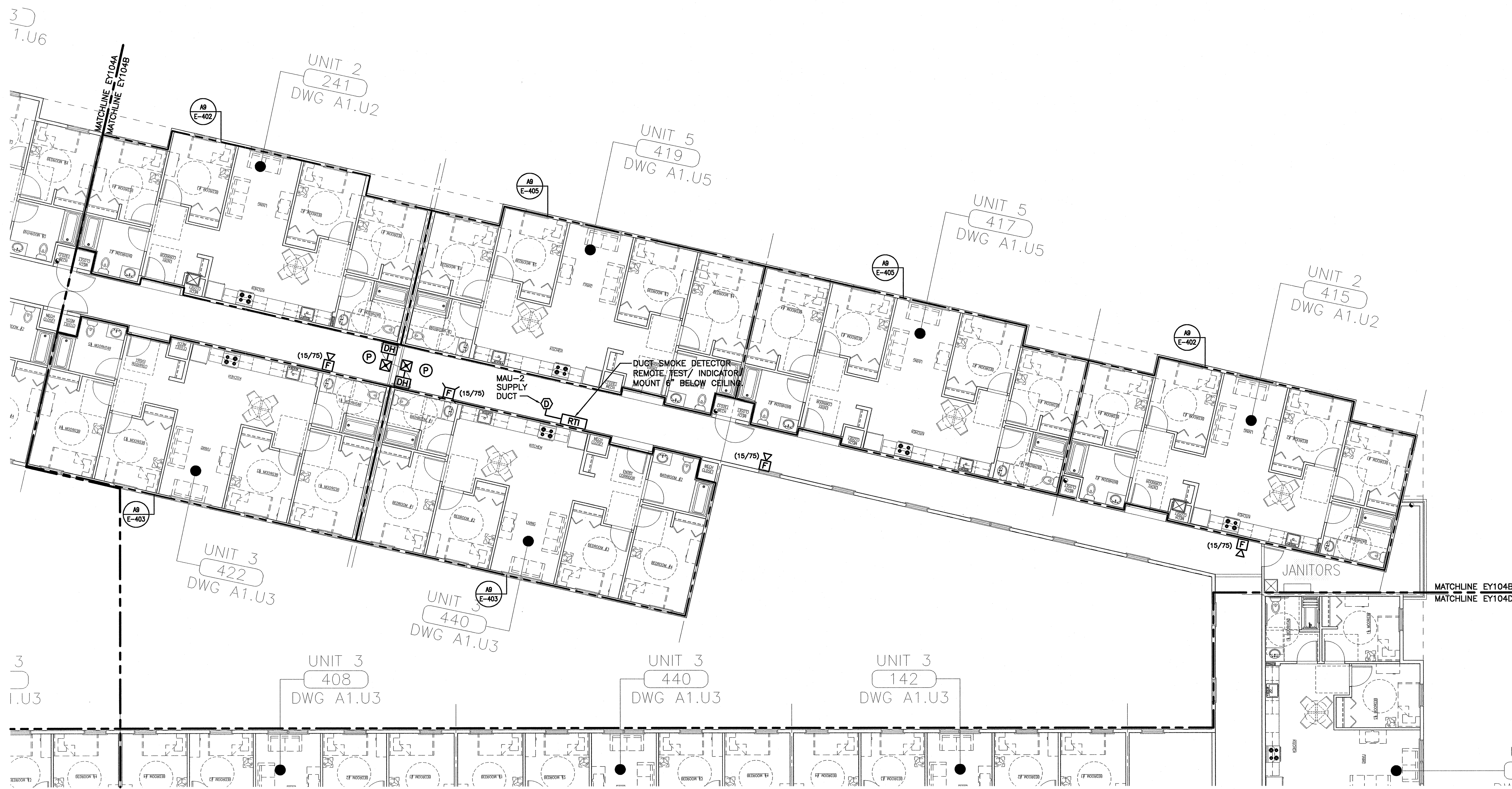
A1 FOURTH FLOOR PLAN