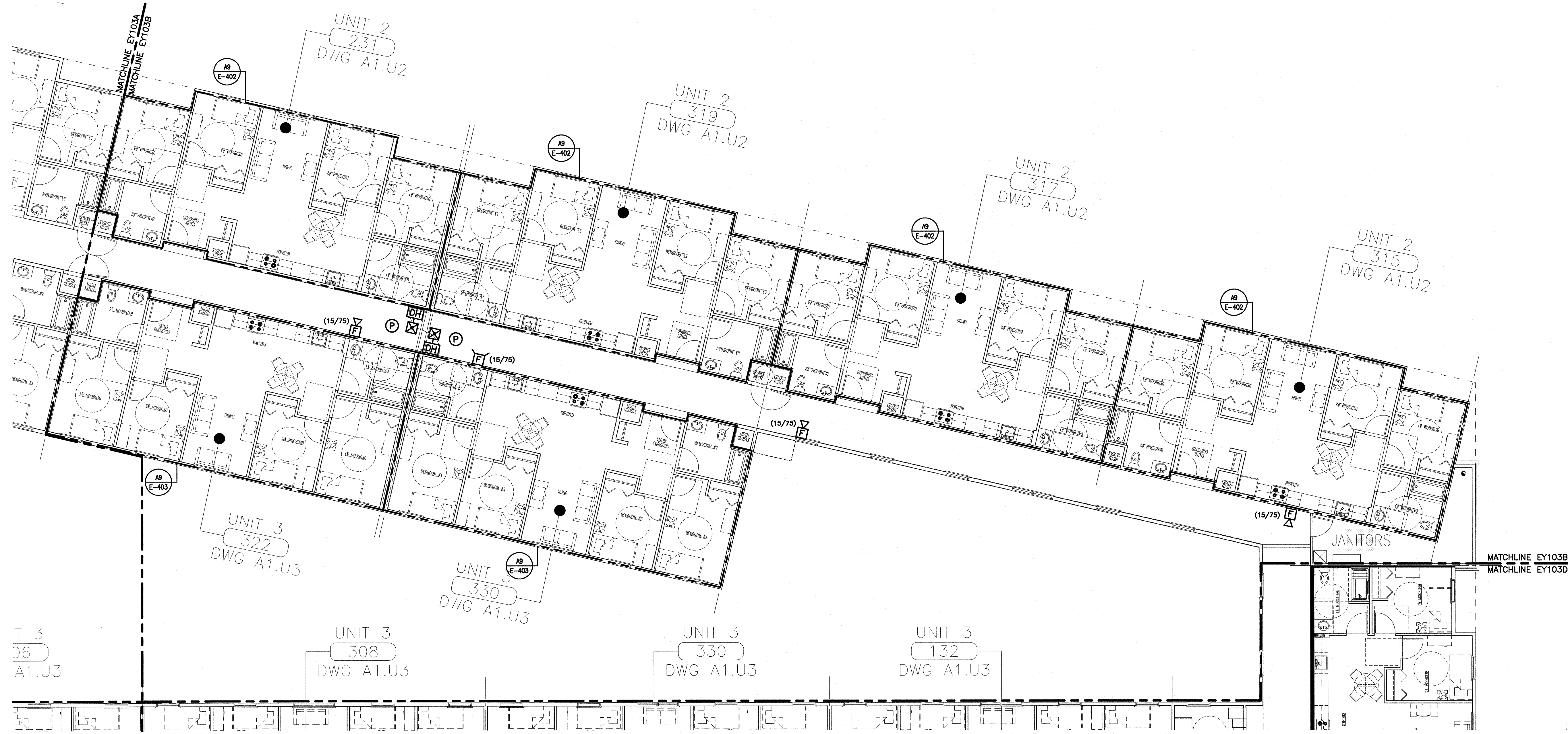
A1 THIRD FLOOR PLAN 1/8"=1'-0"