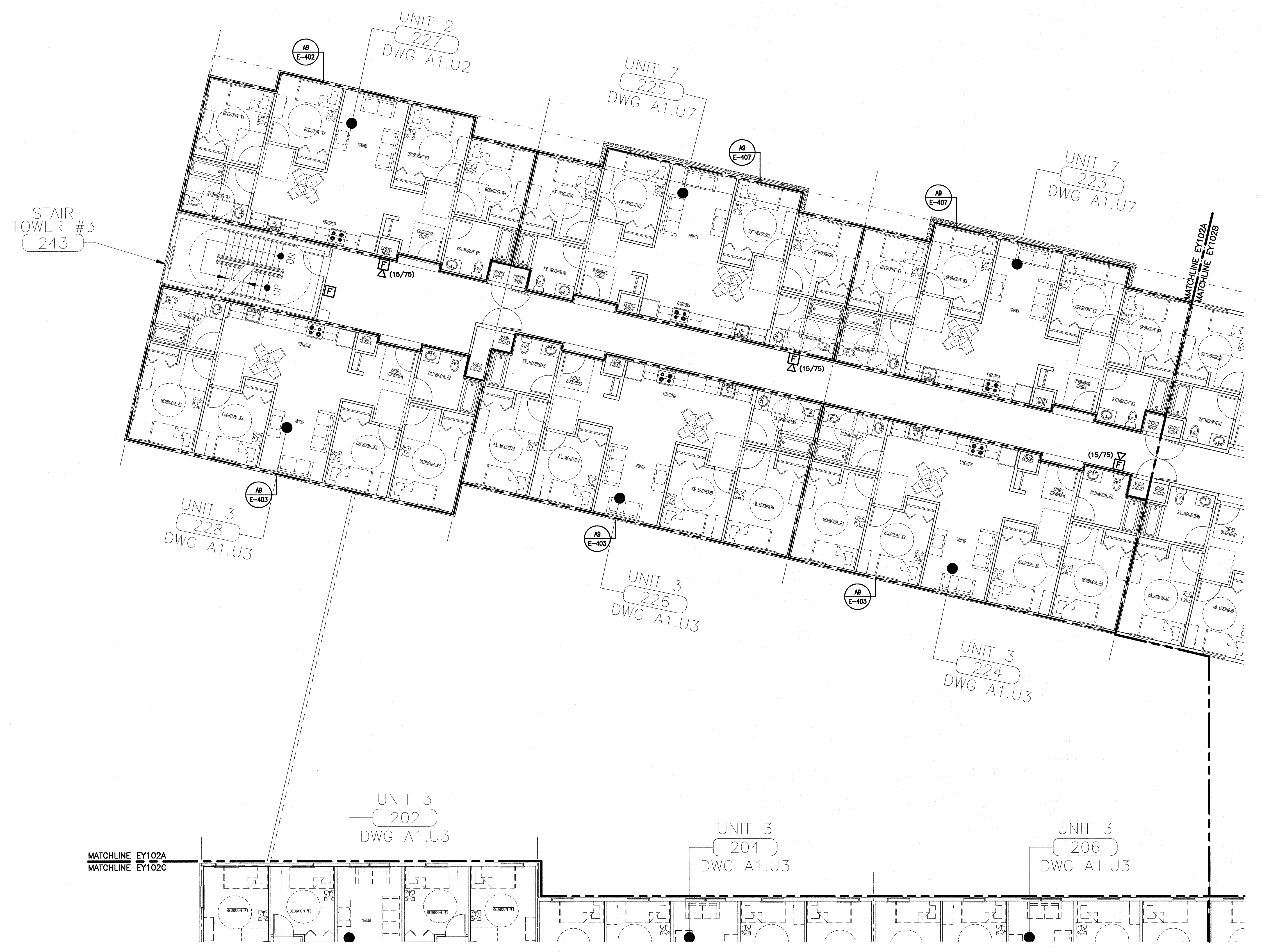
A1 SECOND FLOOR PLAN 1/8"=1'-0"