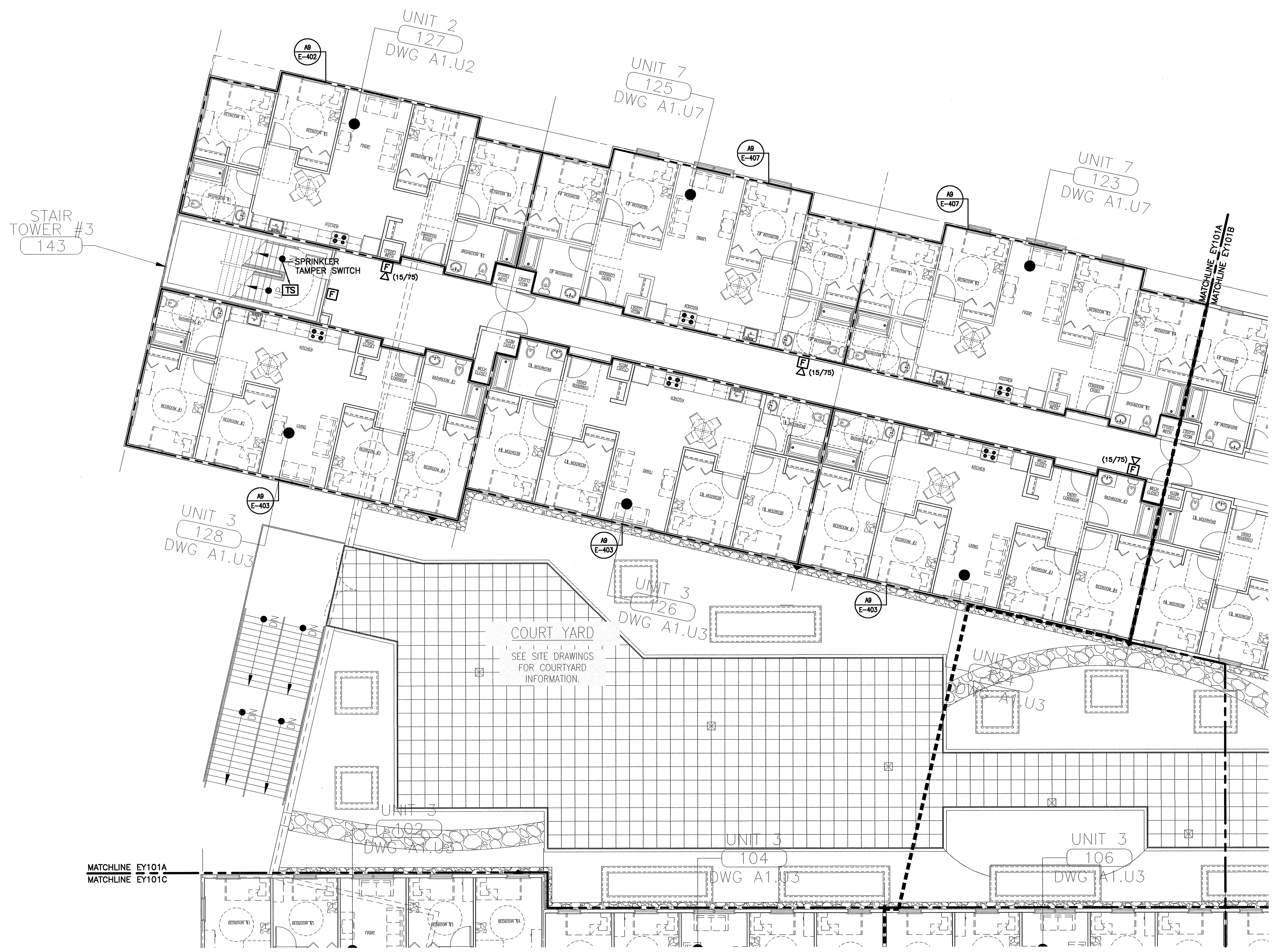
A1 FIRST FLOOR PLAN