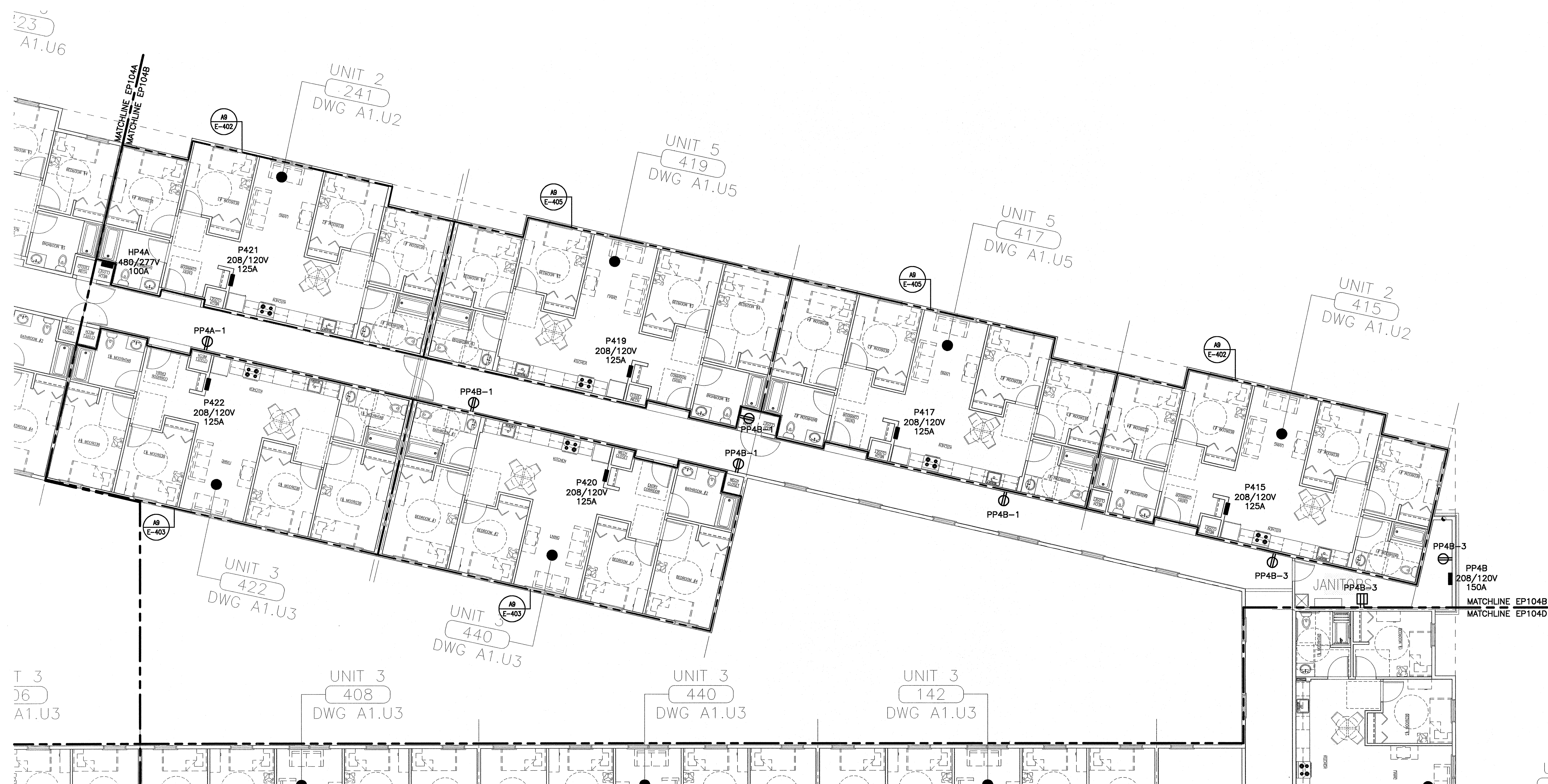
A1 FOURTH FLOOR PLAN

SHEET No. EP104B © copyright 2007 ESB INC.