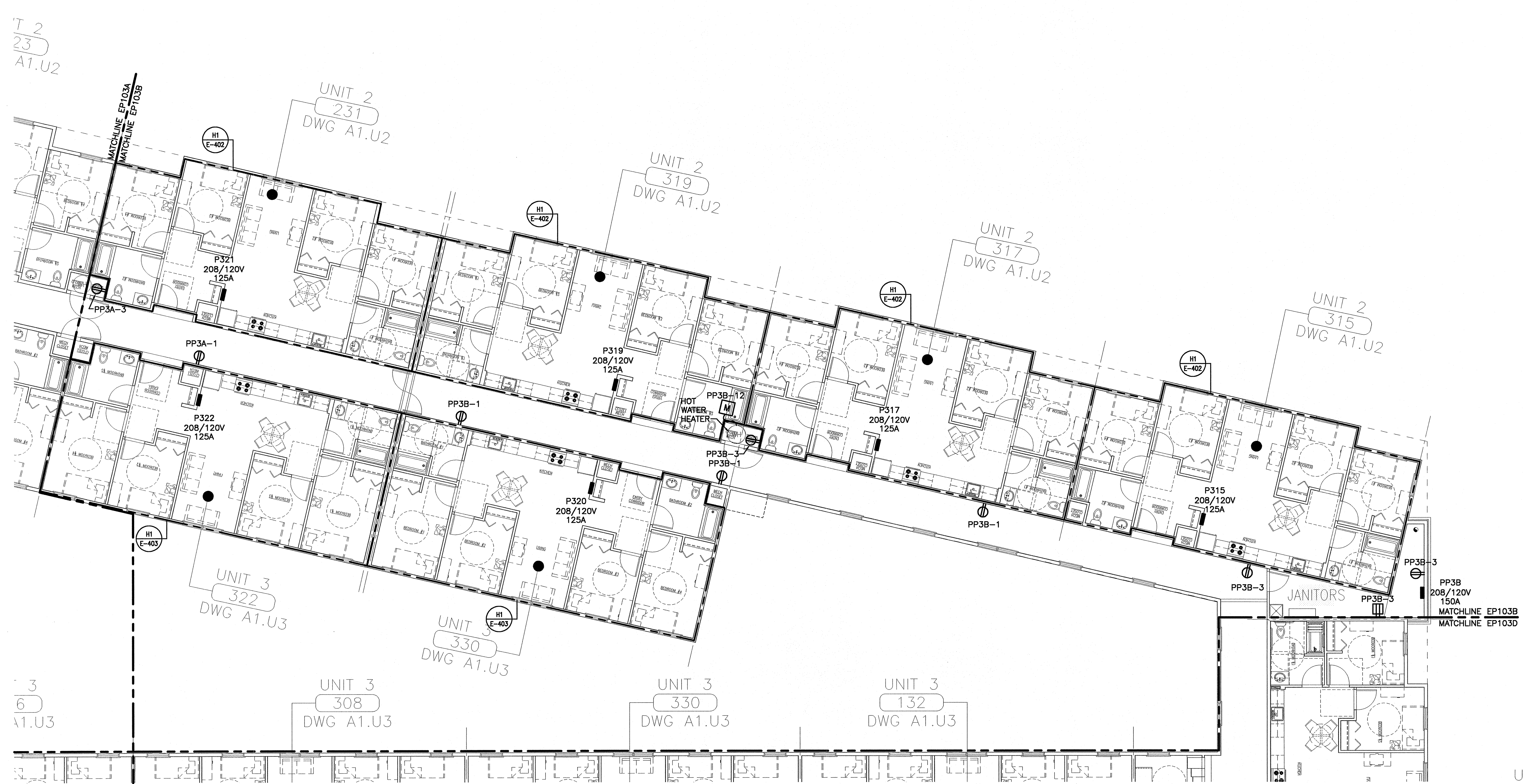
A1 THIRD FLOOR PLAN 1/8"=1'-0"

SHEET No. EP103B © copyright 2007 SMART Inc.