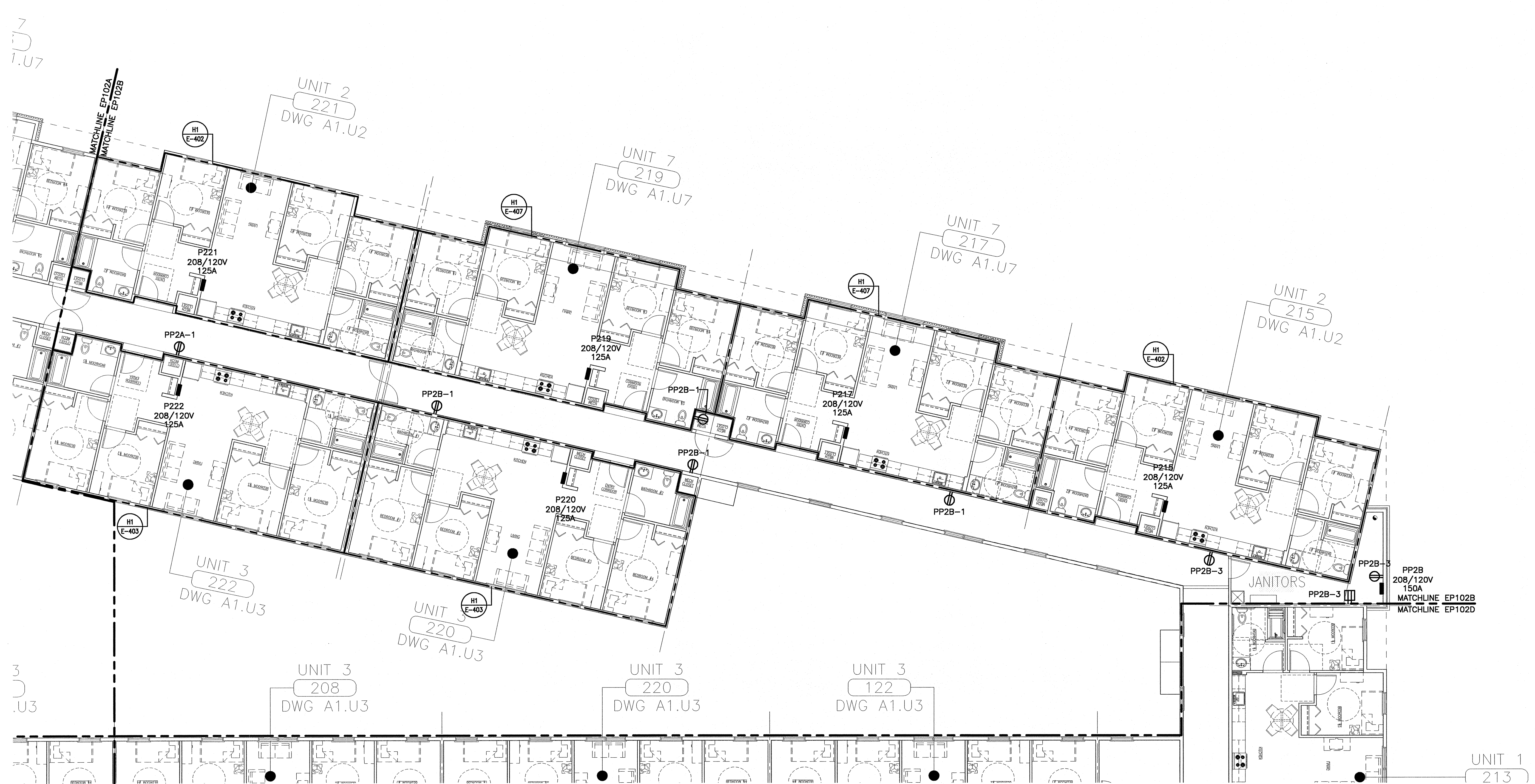
A1 SECOND FLOOR PLAN 1/16"=1'-0"

SHEET No. EP102B © copyright 2007 smart inc.