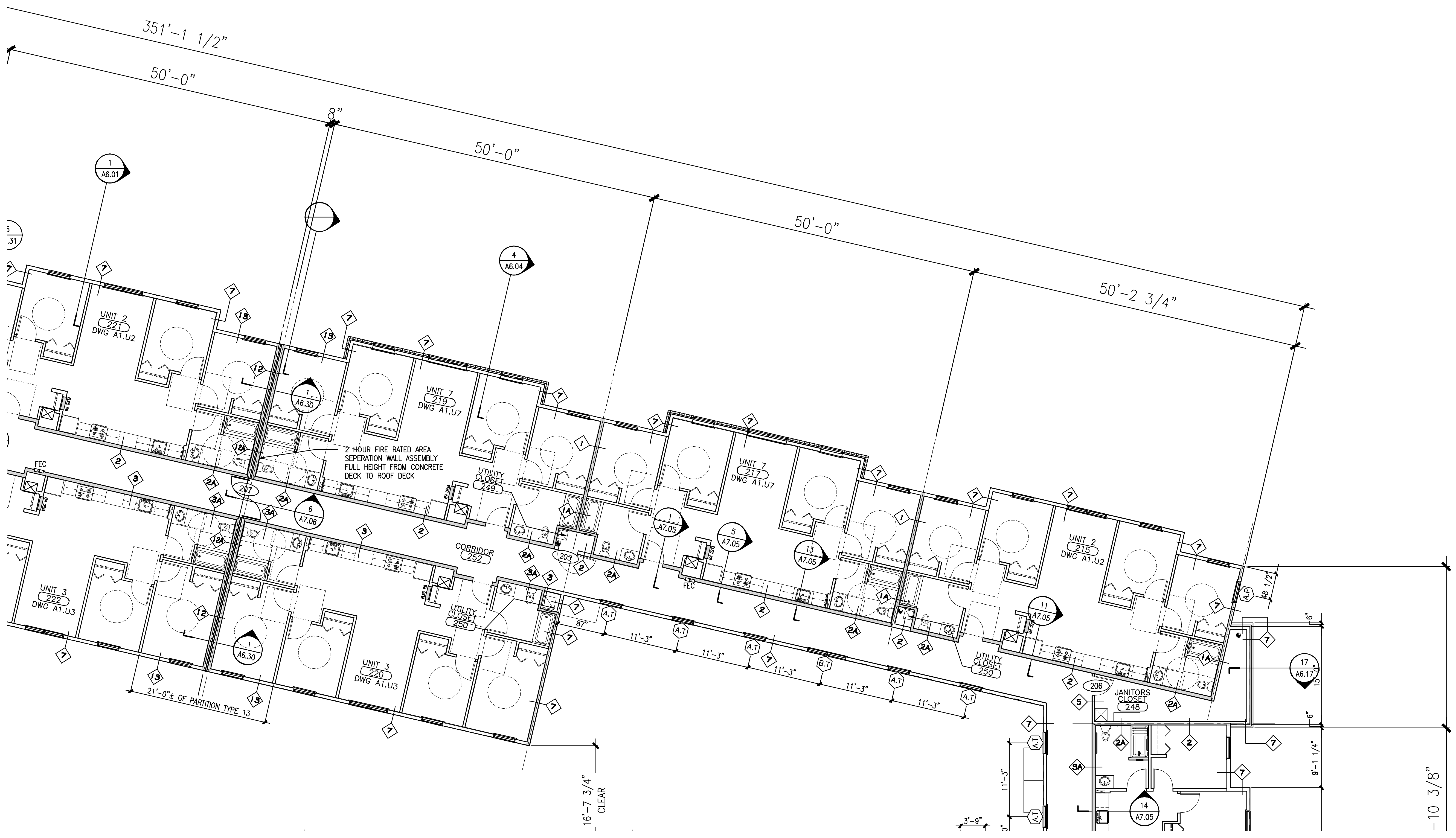
C ENLARGED PLAN - SECOND FLOOR - AREA C REFERENCED FROM: SCALE: 1/4" = 1'-0"