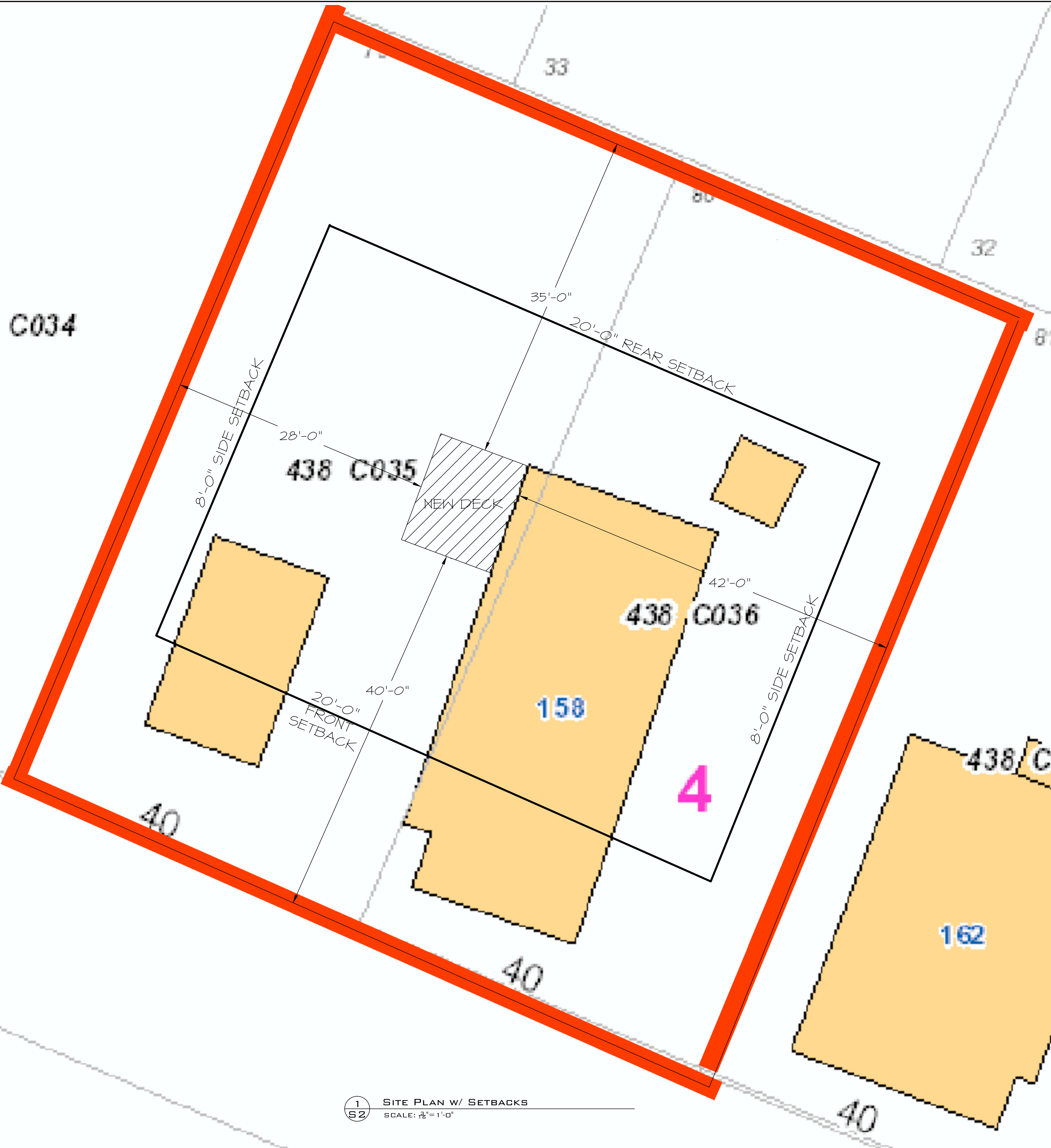
1 SITE PLAN W/ SETBACKS SCALE: 1/8" = 1'-0"