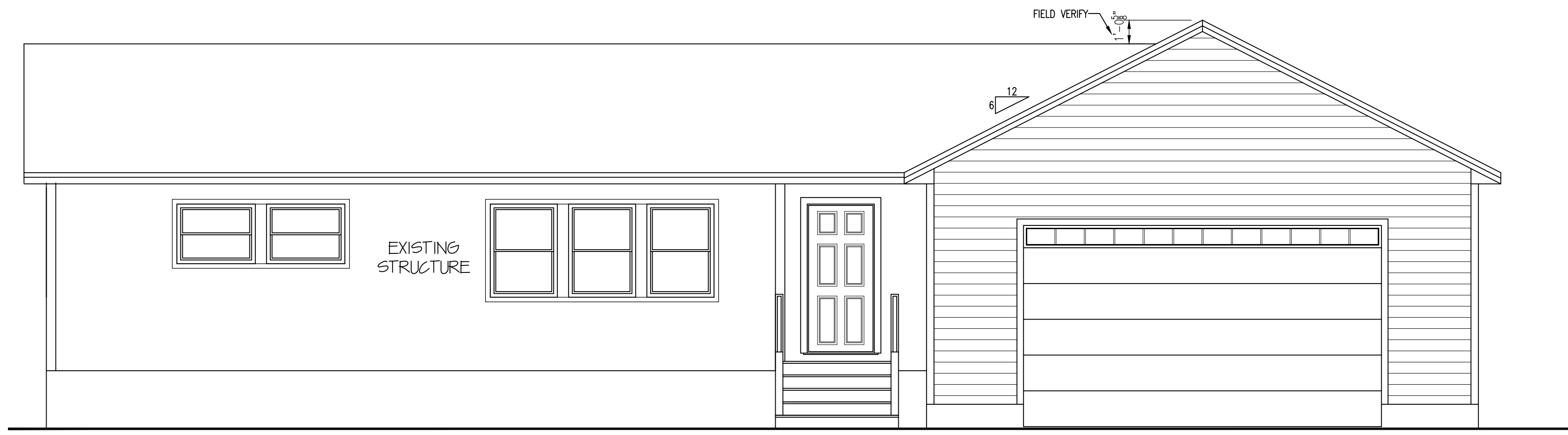
○ FRONT ELEVATION