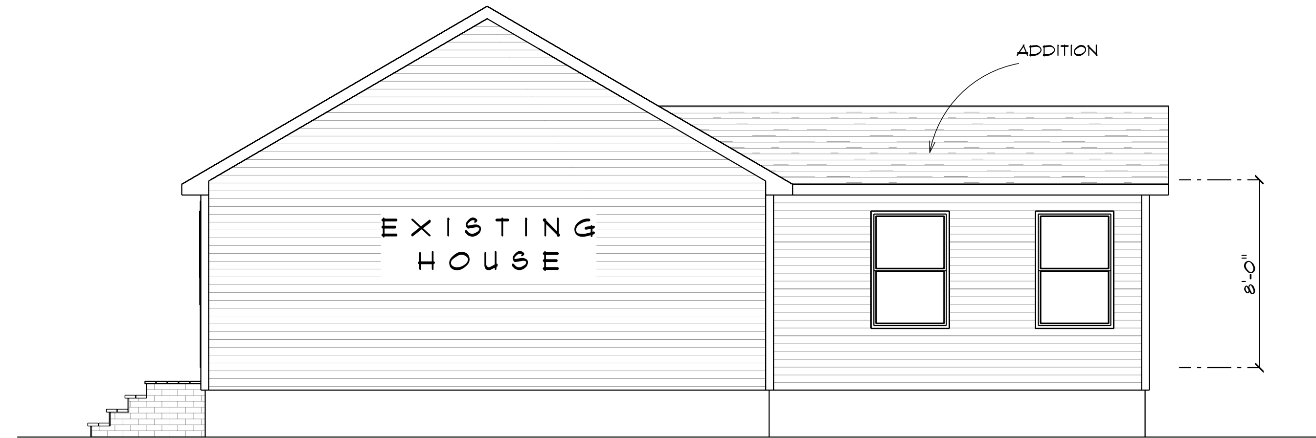
RIGHT ELEVATION SCALE: 1/4" = 1'-0"