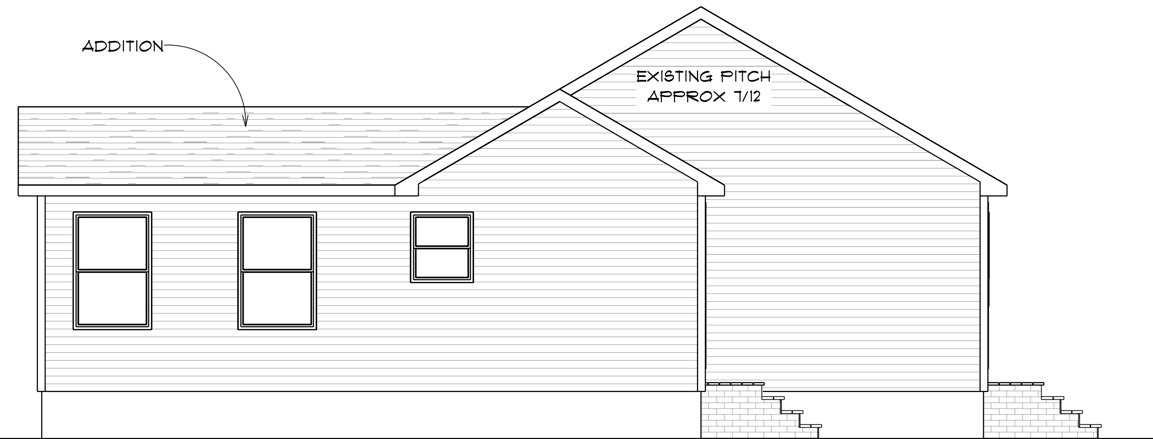
LEFT ELEVATION SCALE: 1/4" = 1'-0"