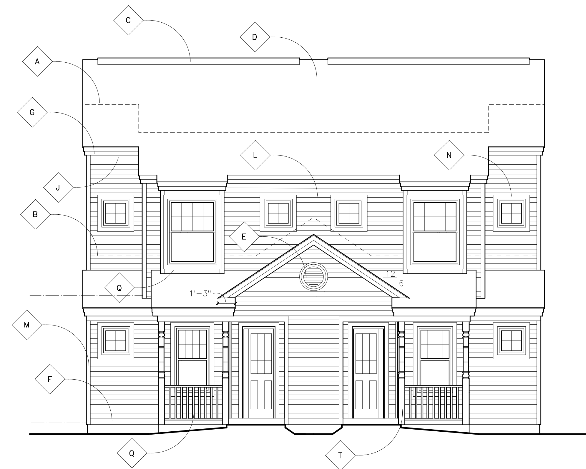
TYPICAL TYPICAL FRONT ELEVATION SCALE: 1/4"=1'-0"