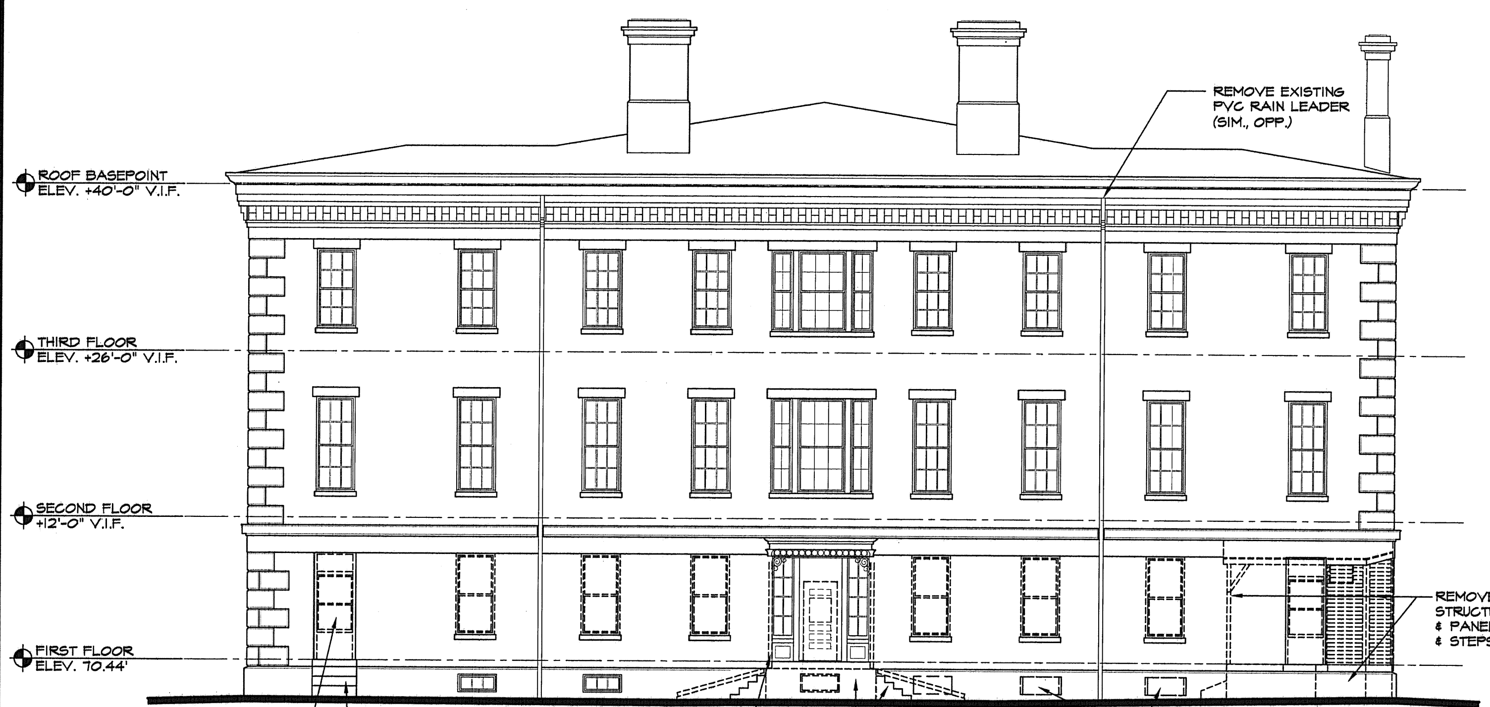
3 EXISTING EAST ELEVATION A4.1 1/8" = 1'-0"