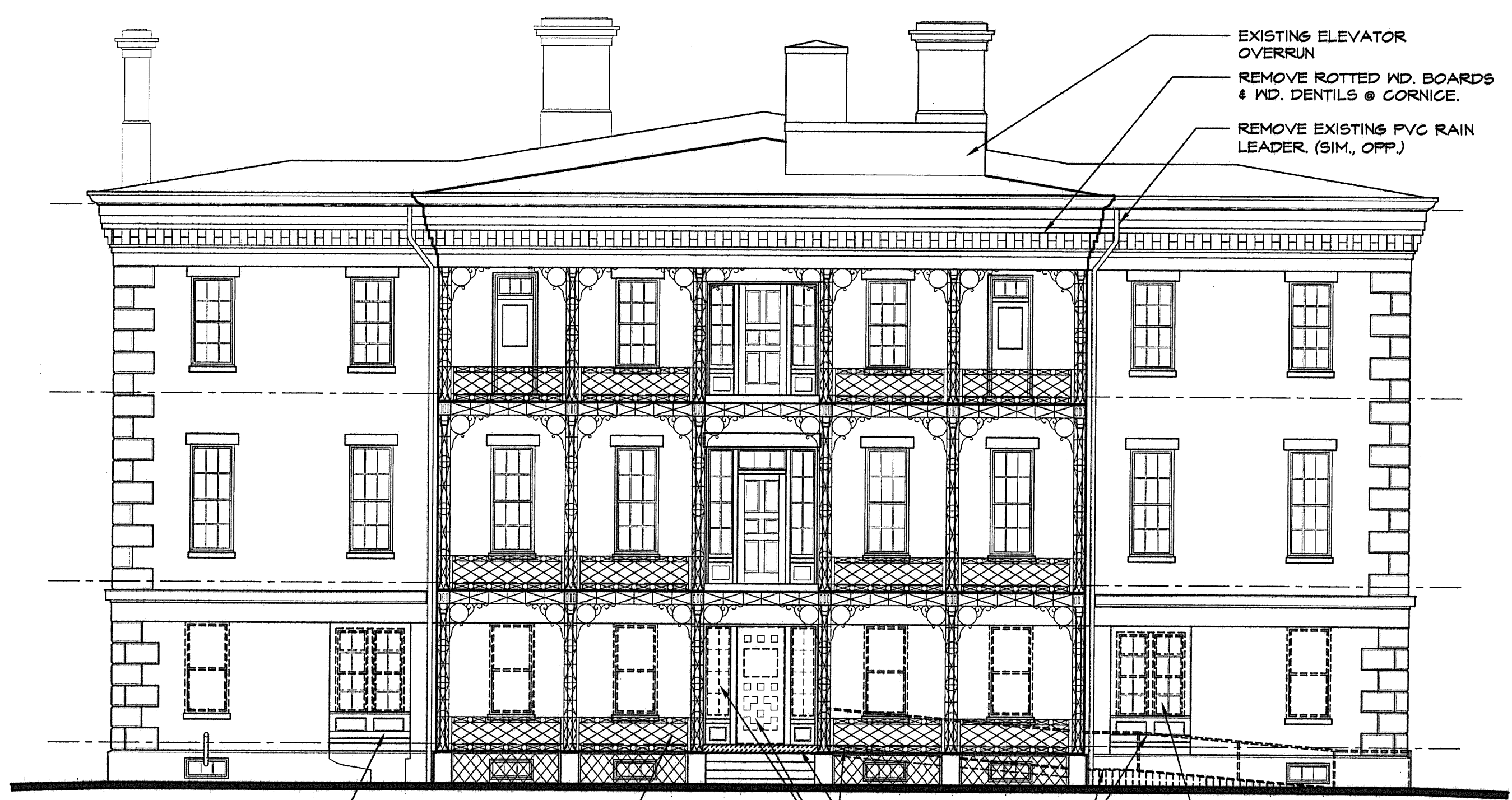
1 EXISTING WEST ELEVATION A4.1 1/8" = 1'-0"