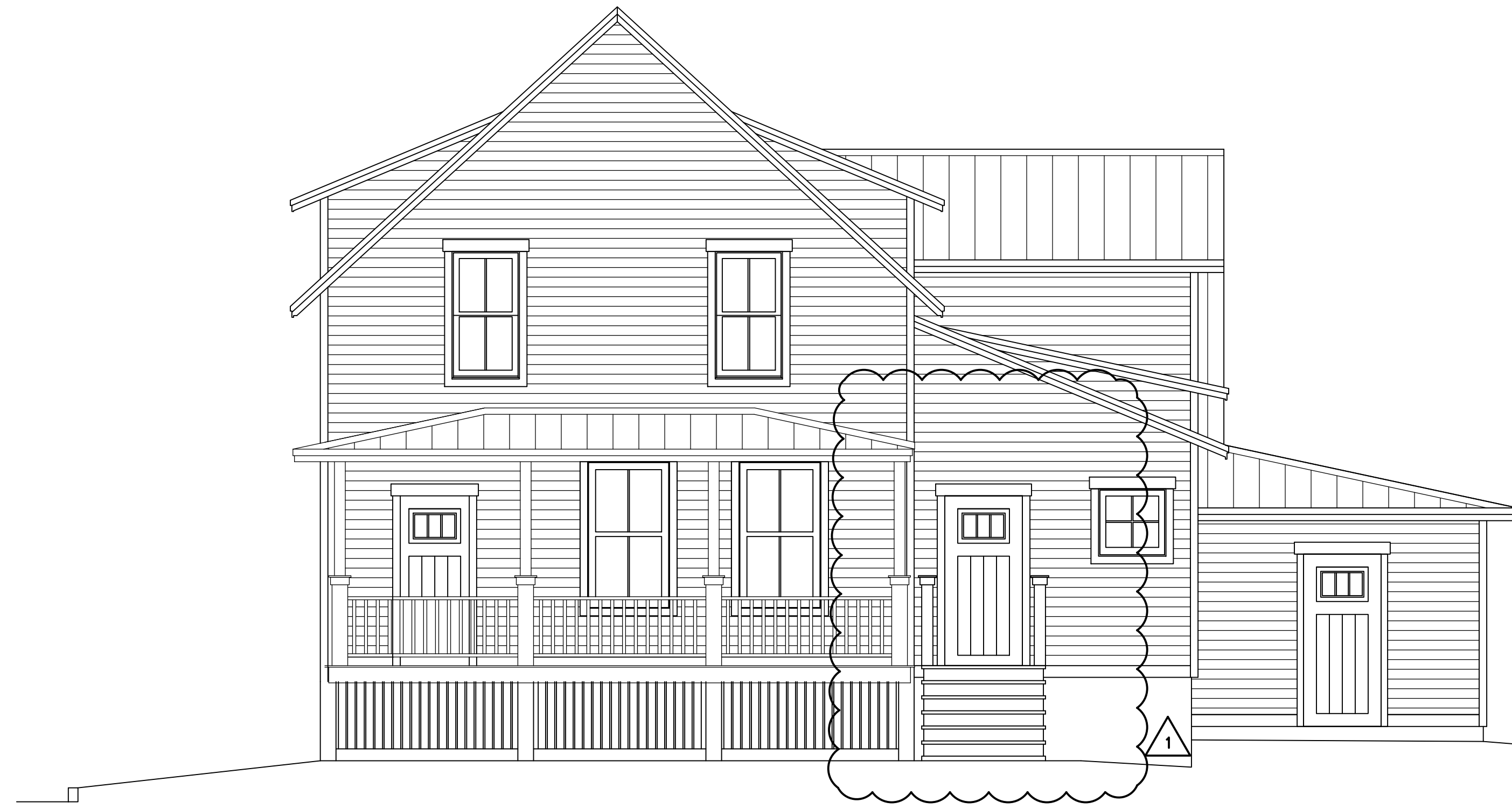
A2 ELEVATION - SOUTH SCALE: 1/4" = 1'-0"