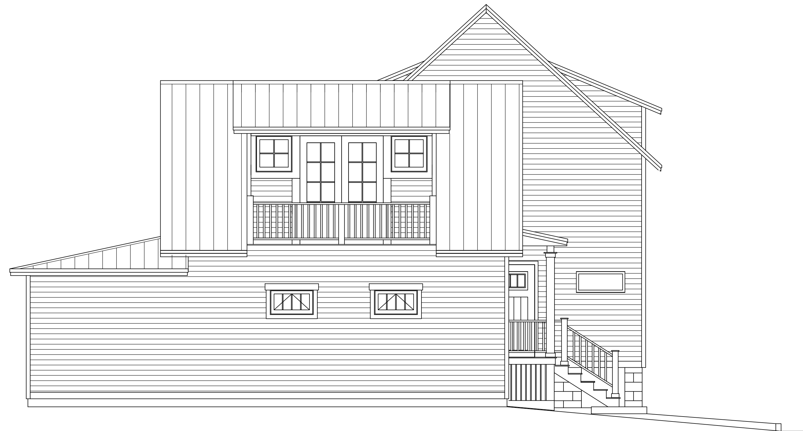
A1 ELEVATION - NORTH SCALE: 1/4" = 1'-0"