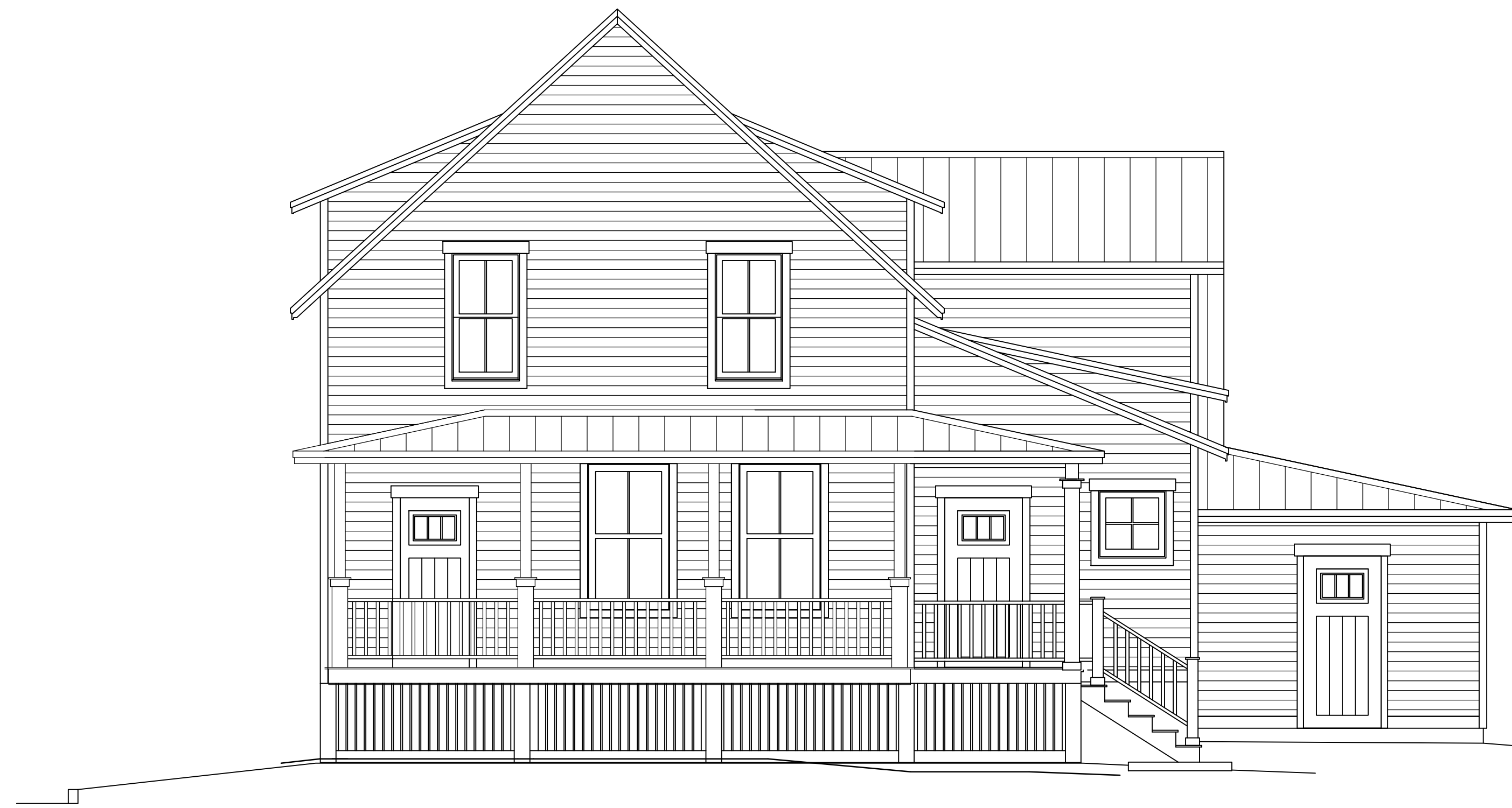
A2 ELEVATION - SOUTH SCALE: 1/4" = 1'-0"