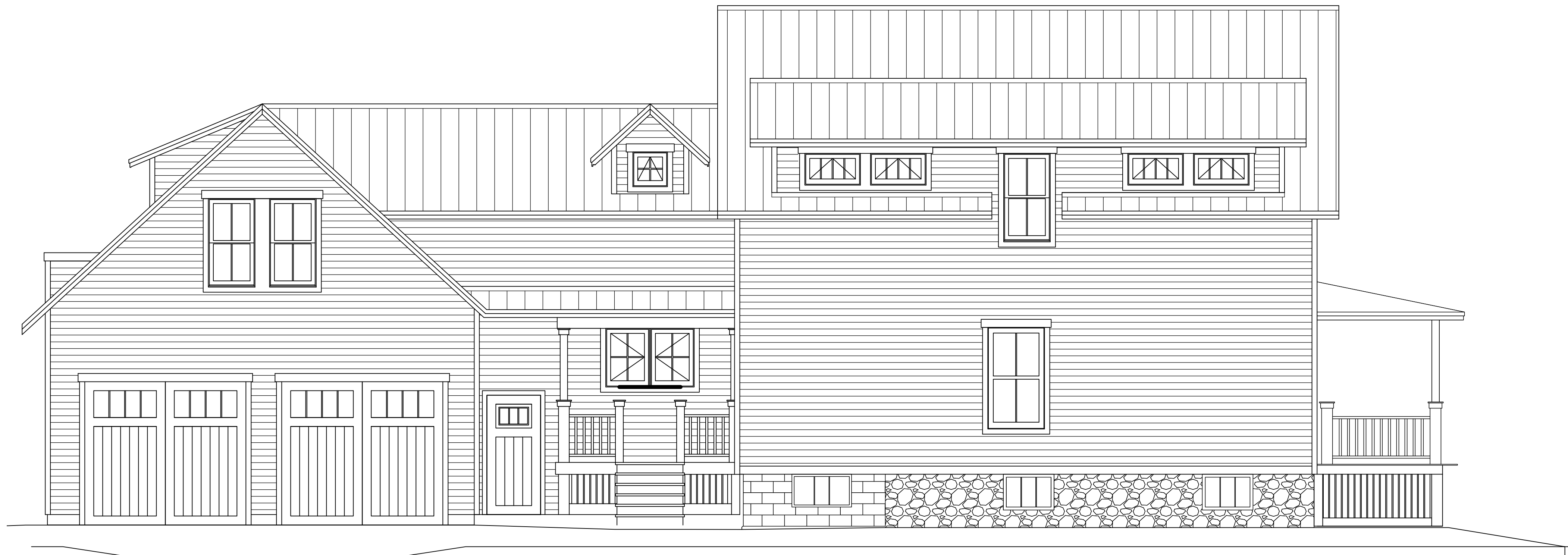
A2 ELEVATION - WEST SCALE: 1/4" = 1'-0"