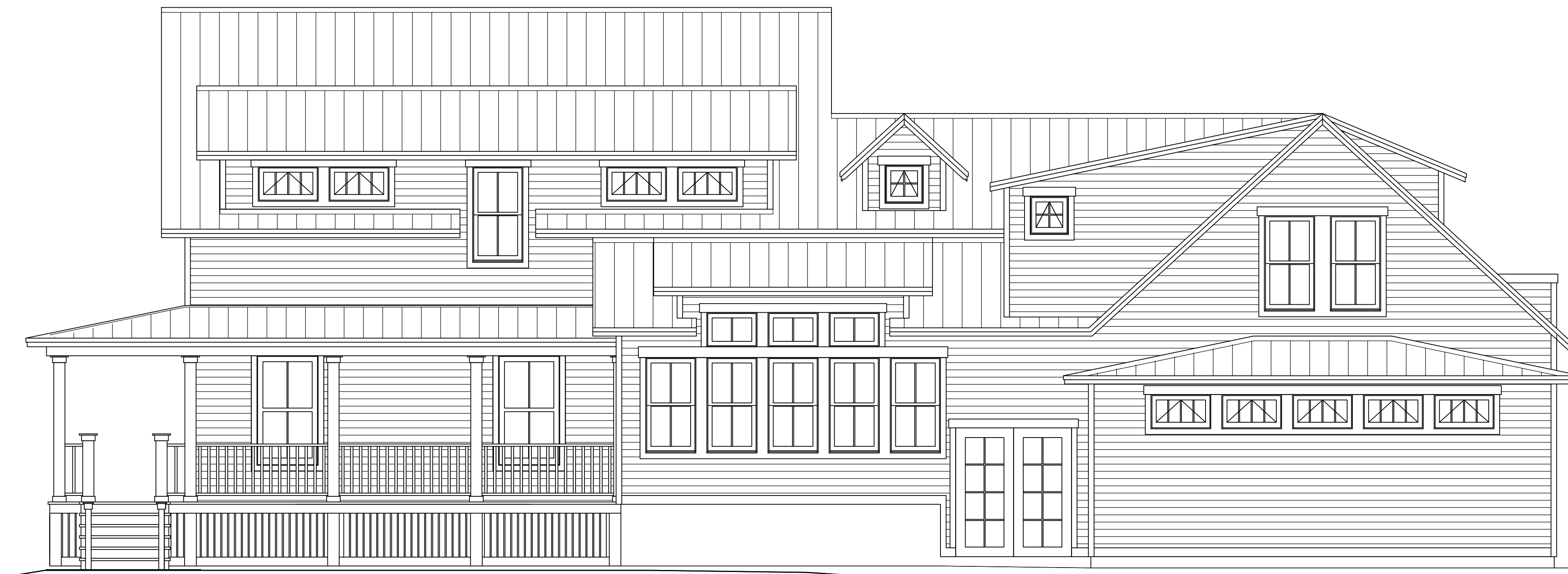
A1 ELEVATION - EAST SCALE: 1/4" = 1'-0"