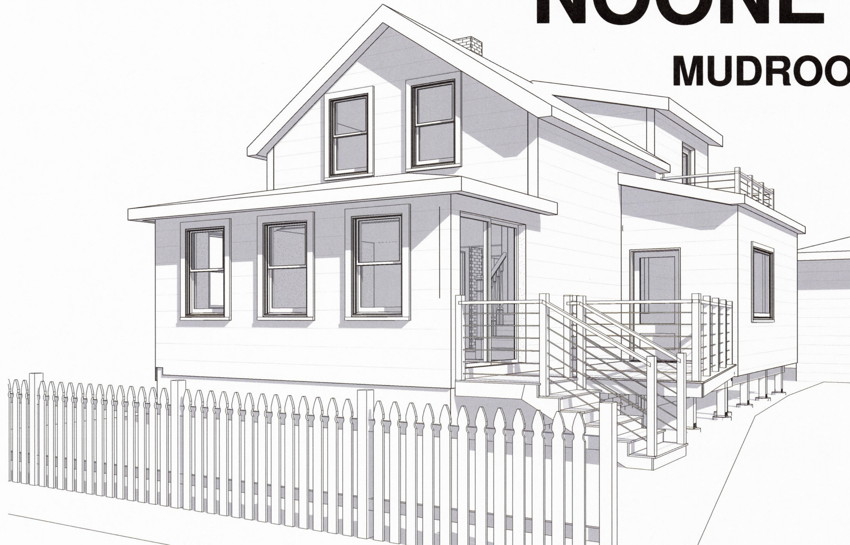
1 VIEW FROM STREET