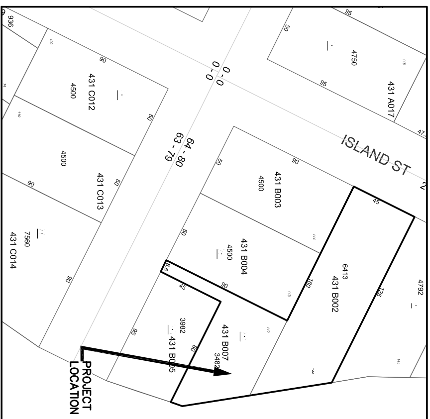
TAX MAP #431 LOTS B007 & B002