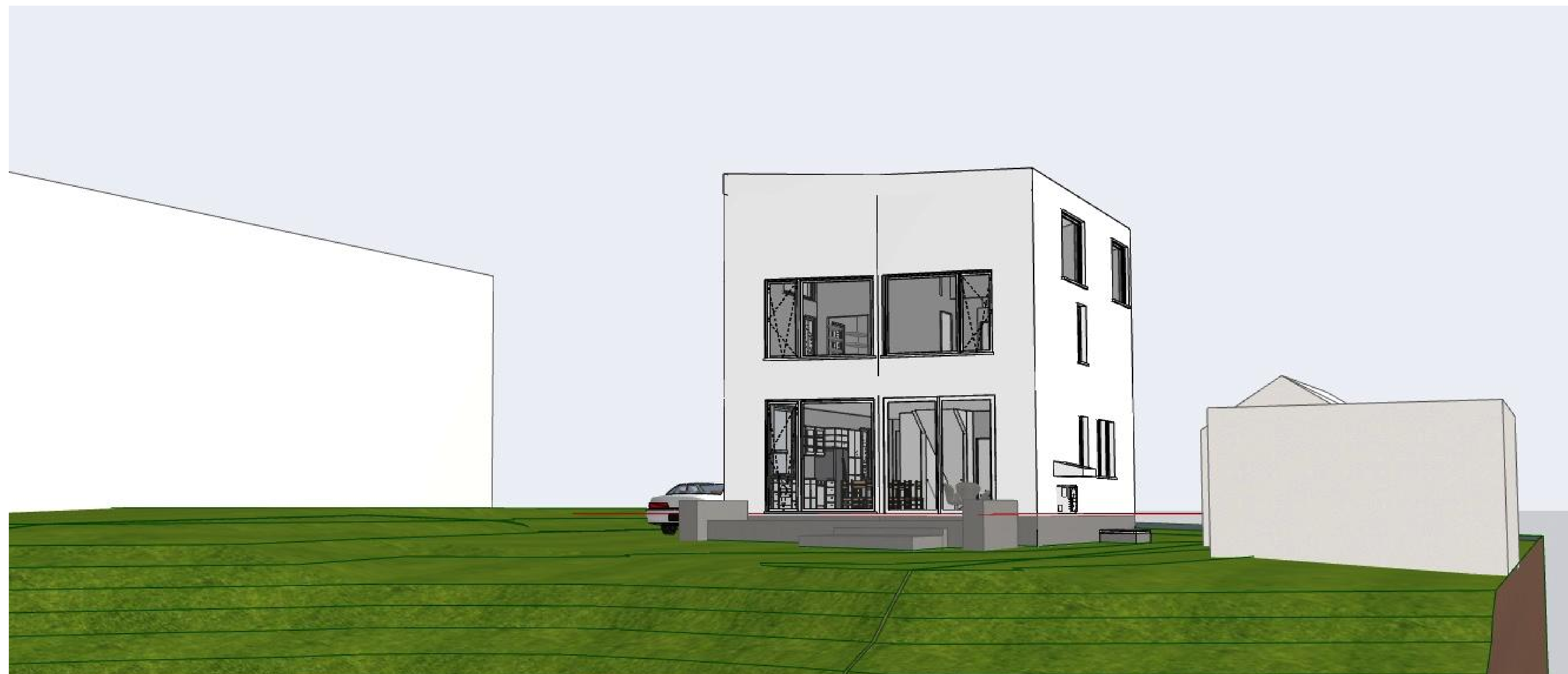
1 WATER SIDE PERSPECTIVE SCALE: 1:38.40