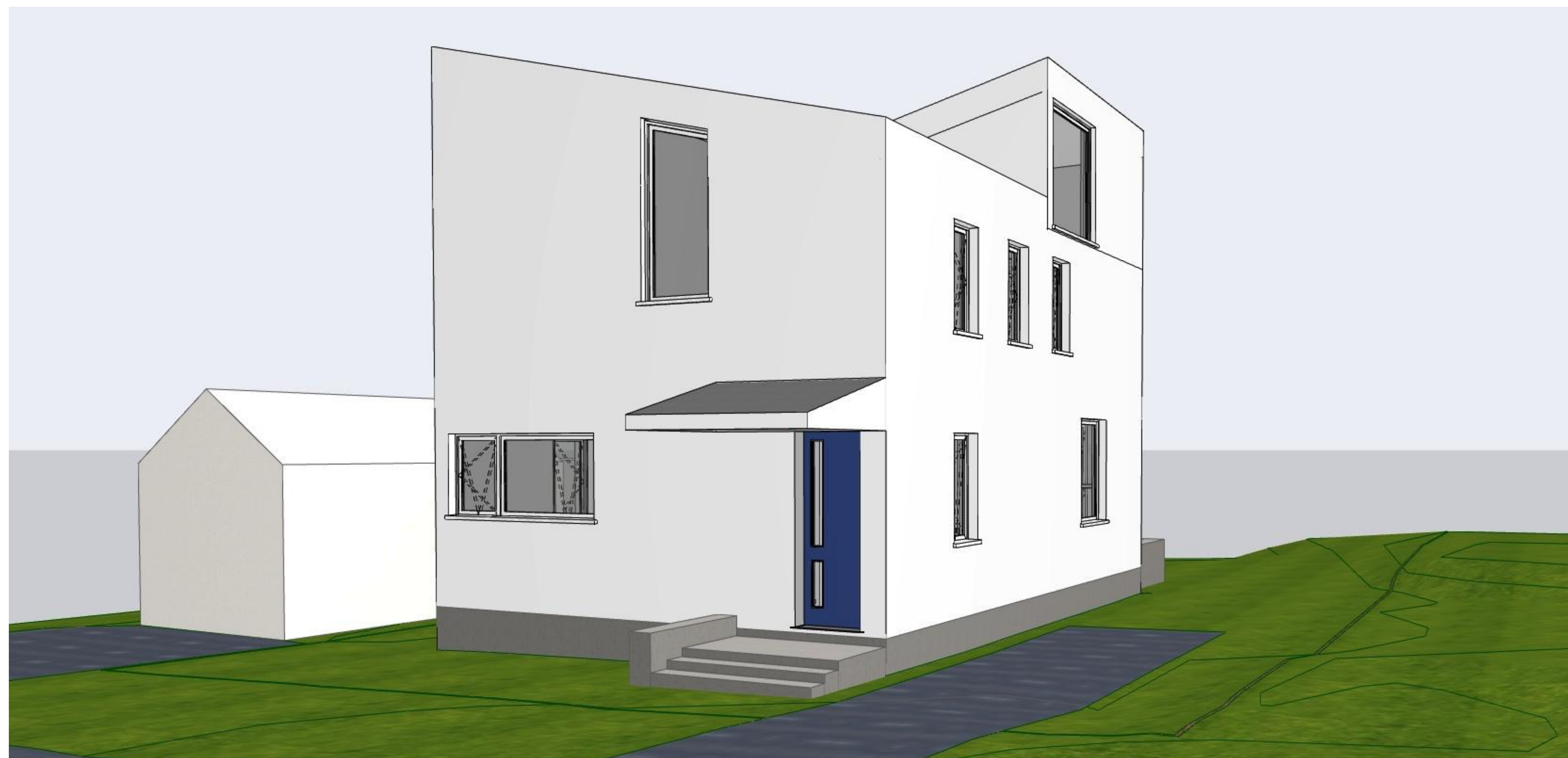
2 STREET PERSPECTIVE SCALE: 1/4" = 1'-0"