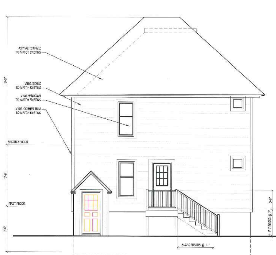
PARKING LOT ELEVATION