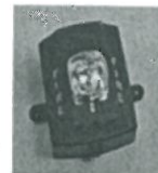
Outdoor Wall Strobe