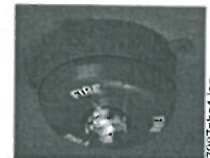
Outdoor Ceiling Strobe