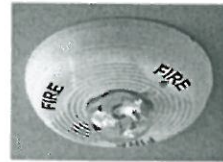
Indoor Ceiling Horn/Strobe