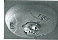
Indoor Ceiling Strobe