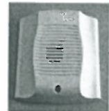
Indoor Wall Horn