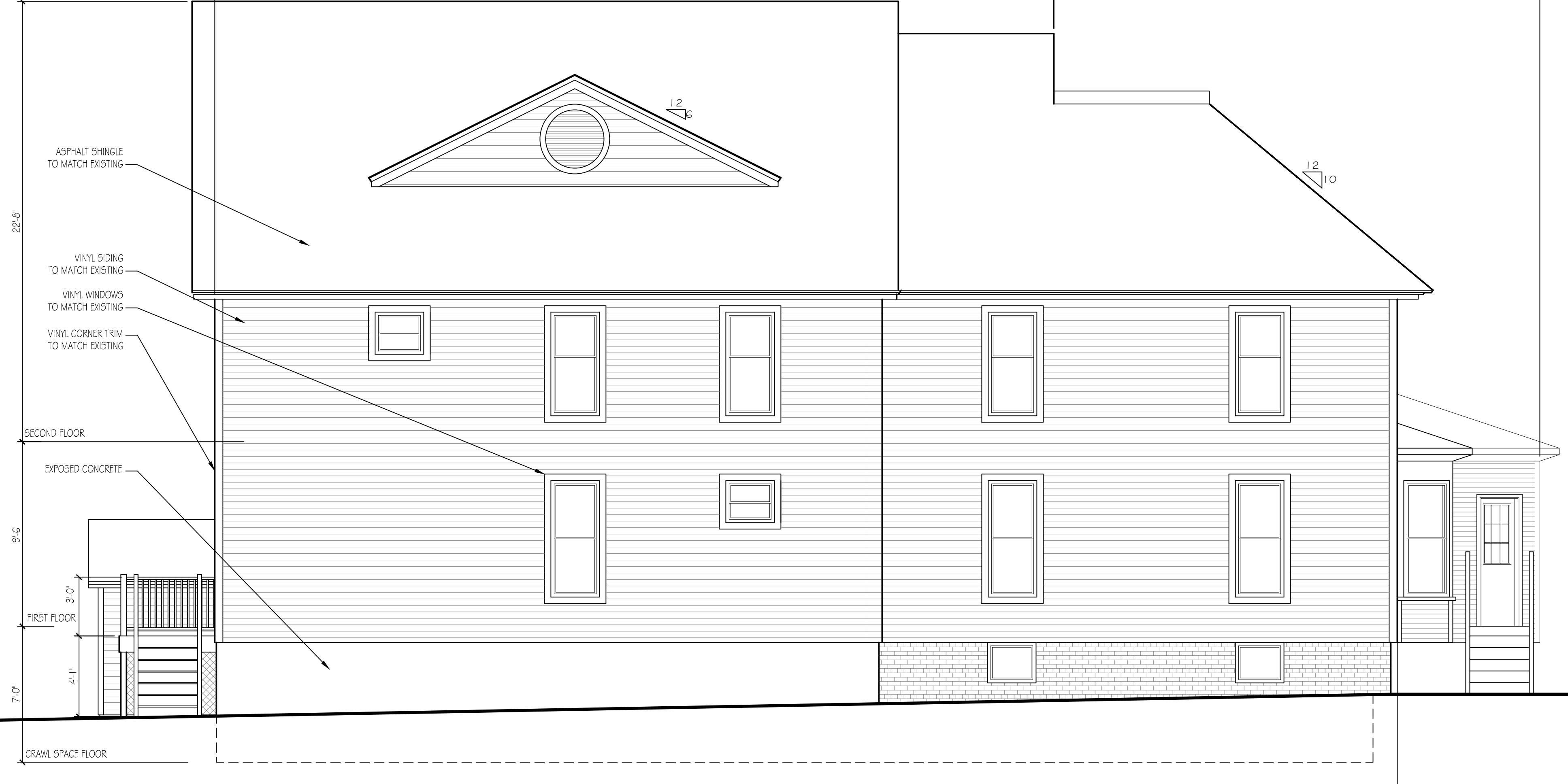
VERANDA STREET ELEVATION SCALE: 1/4"=1'-0"