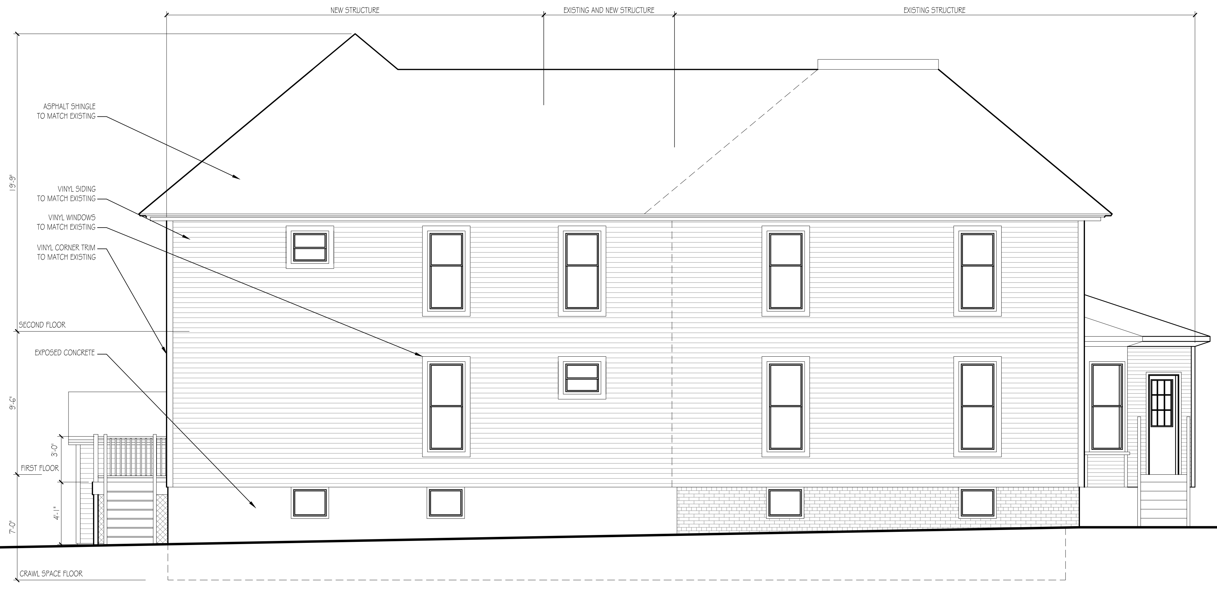
VERANDA STREET ELEVATION SCALE: 1/4"=1'-0"