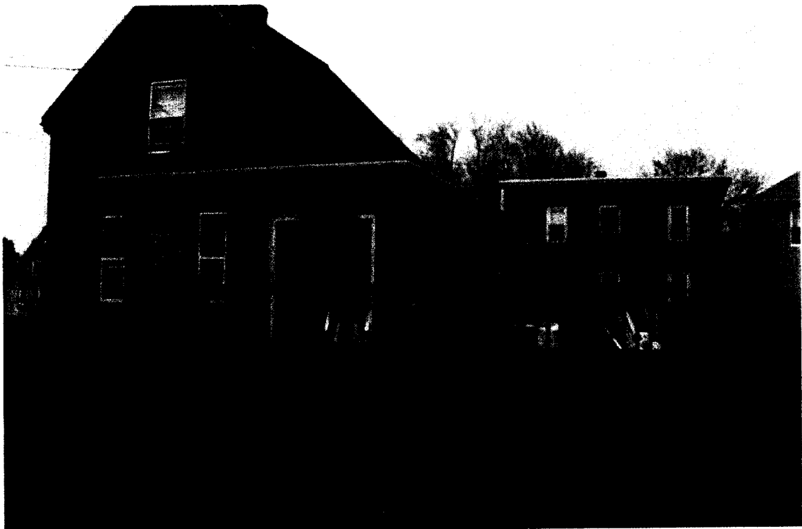
DECK SECTION TO BE REMOVED