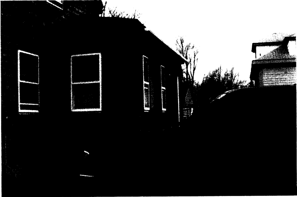
HOUSE SECTION TO BE REMOVED