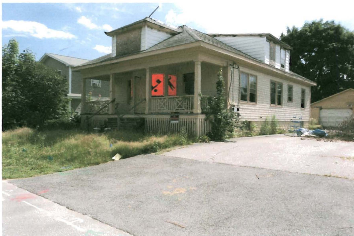
LAWLESS HOUSE 26 HAWTHORNE ST. PORTLAND, ME