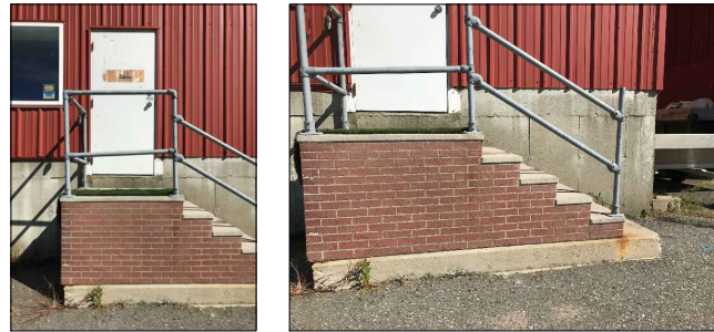
A - View of existing front step no scale