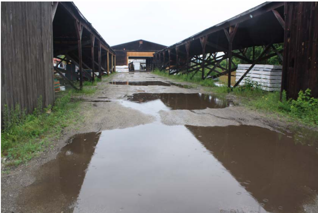
Station 108 Looking North between Building 3 and 4