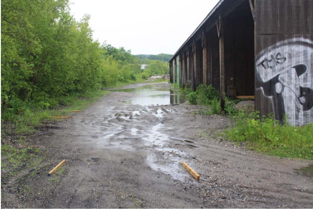
Station 111+00 Looking North between the Western property line and Building 5