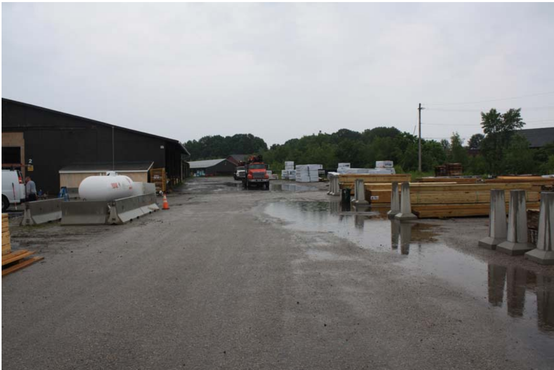
Station 103+00 Looking South