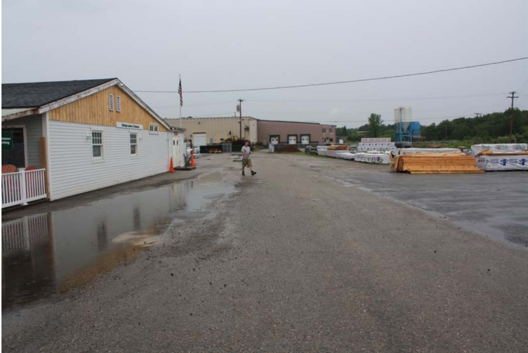
Station 103+00 Looking North