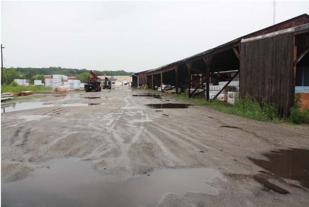
Station 108+00 Looking North