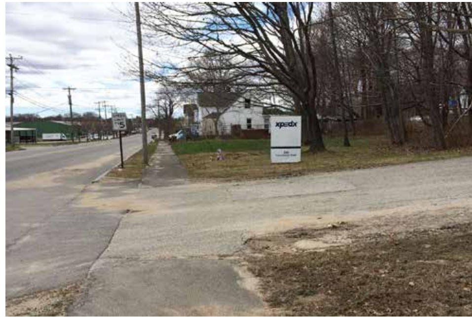
Existing D/F sign ( 5'-10" x 3'-10" ). Remove and replace with new sign shown below.