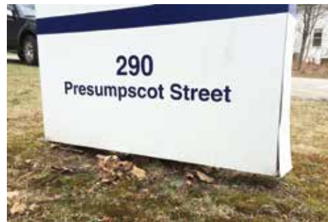
Close-up of existing damaged sign

Description: FCO - [Router cut] Material: Aluminum Depth: 1/4" Color: Paint White Returns: Same as face Installation: Flush to base