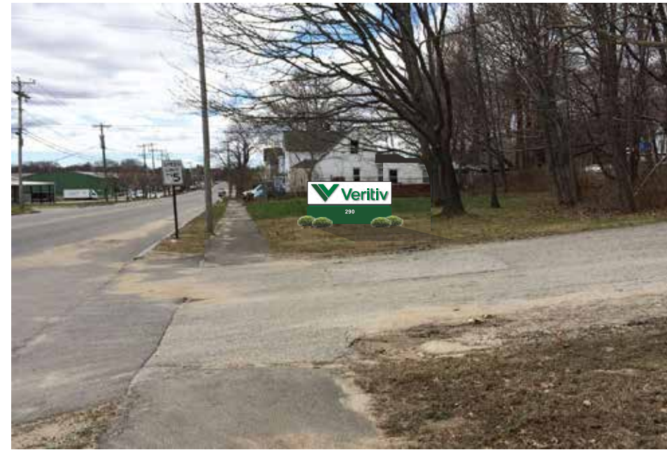
Proposed new signage