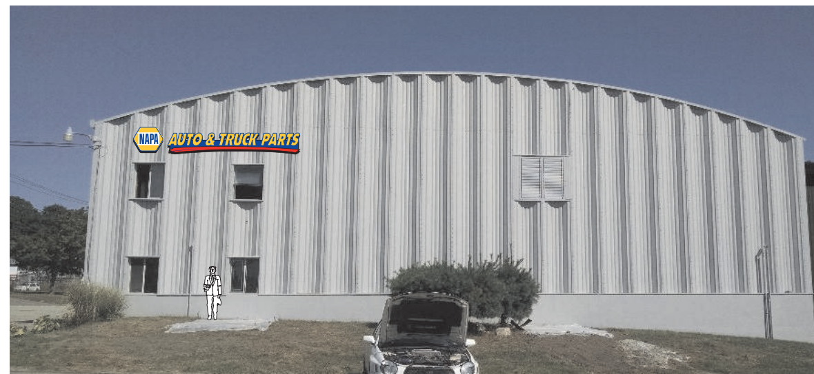
PHOTO COMPOSITES NO SCALE