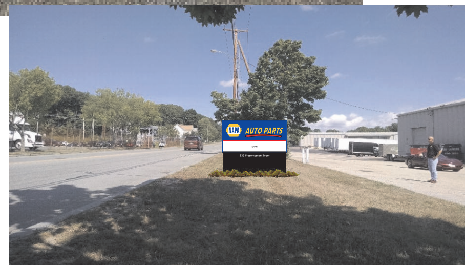
PHOTO COMPOSITE NO SCALE