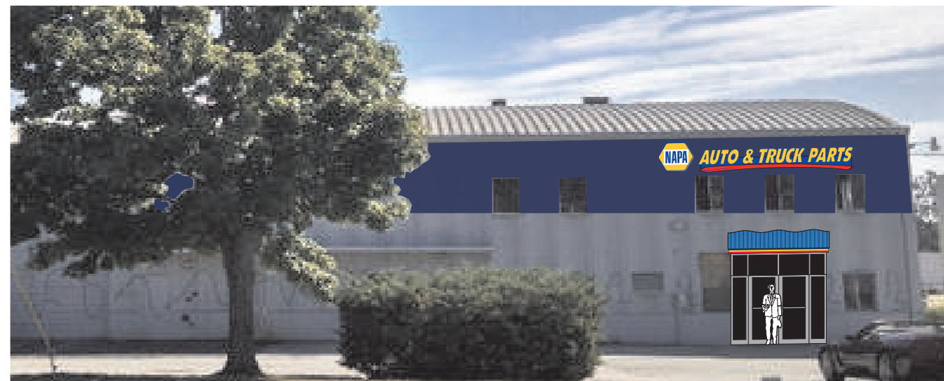
PHOTO COMPOSITES NO SCALE