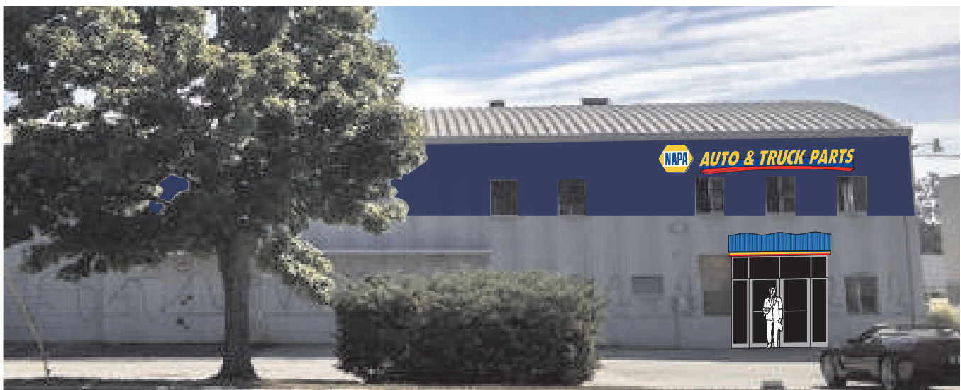
PHOTO COMPOSITES NO SCALE