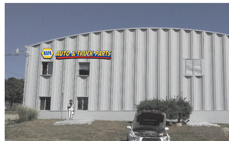
PHOTO COMPOSITES NO SCALE