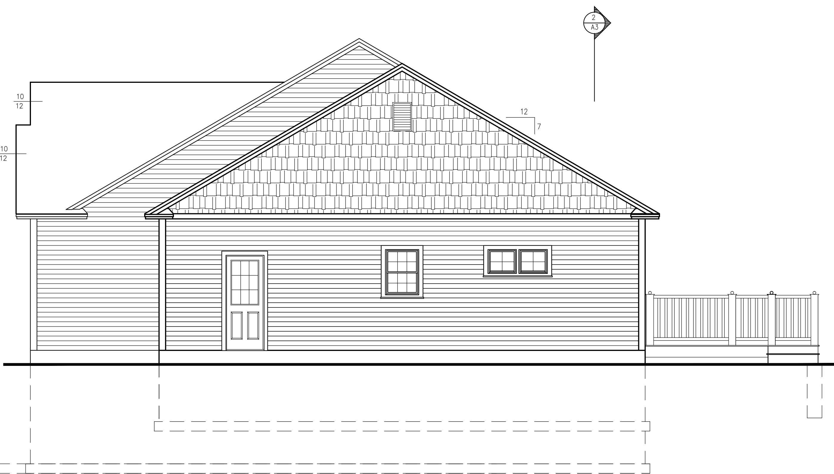
RIGHT SIDE ELEVATION 1/4" = 1'-0"