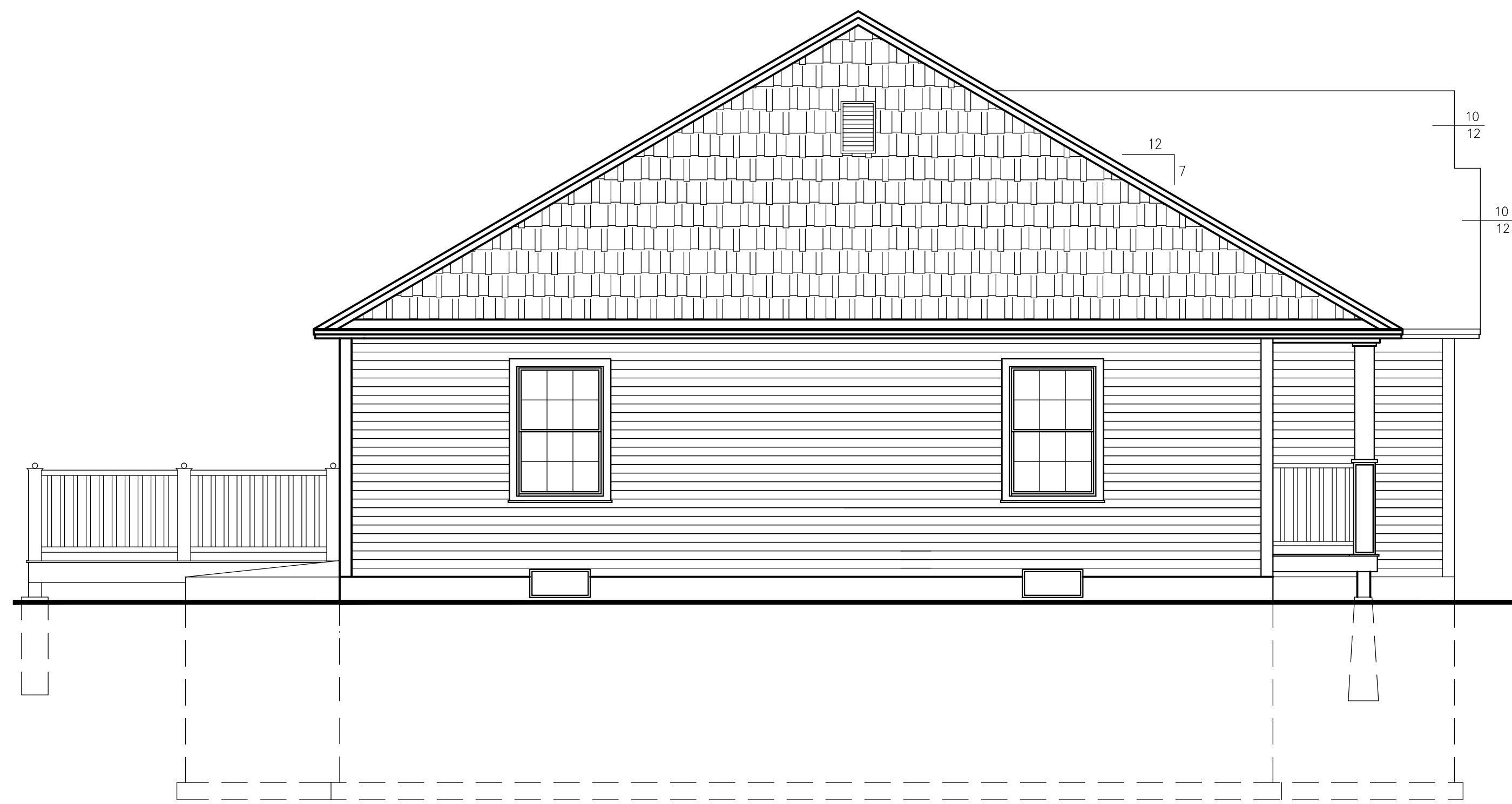
LEFT SIDE ELEVATION 1/4" = 1'-0"