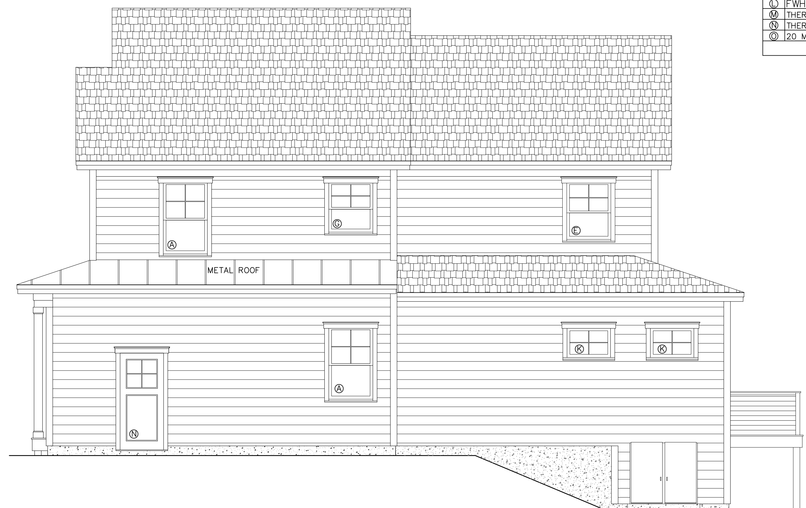
3 RIGHT SIDE ELEVATION 1/4" = 1'-0"

1ST FLOOR .....1038 SQ. FT. 2ND FLOOR .....1175 SQ. FT. TOTAL .....2213 SQ. FT.