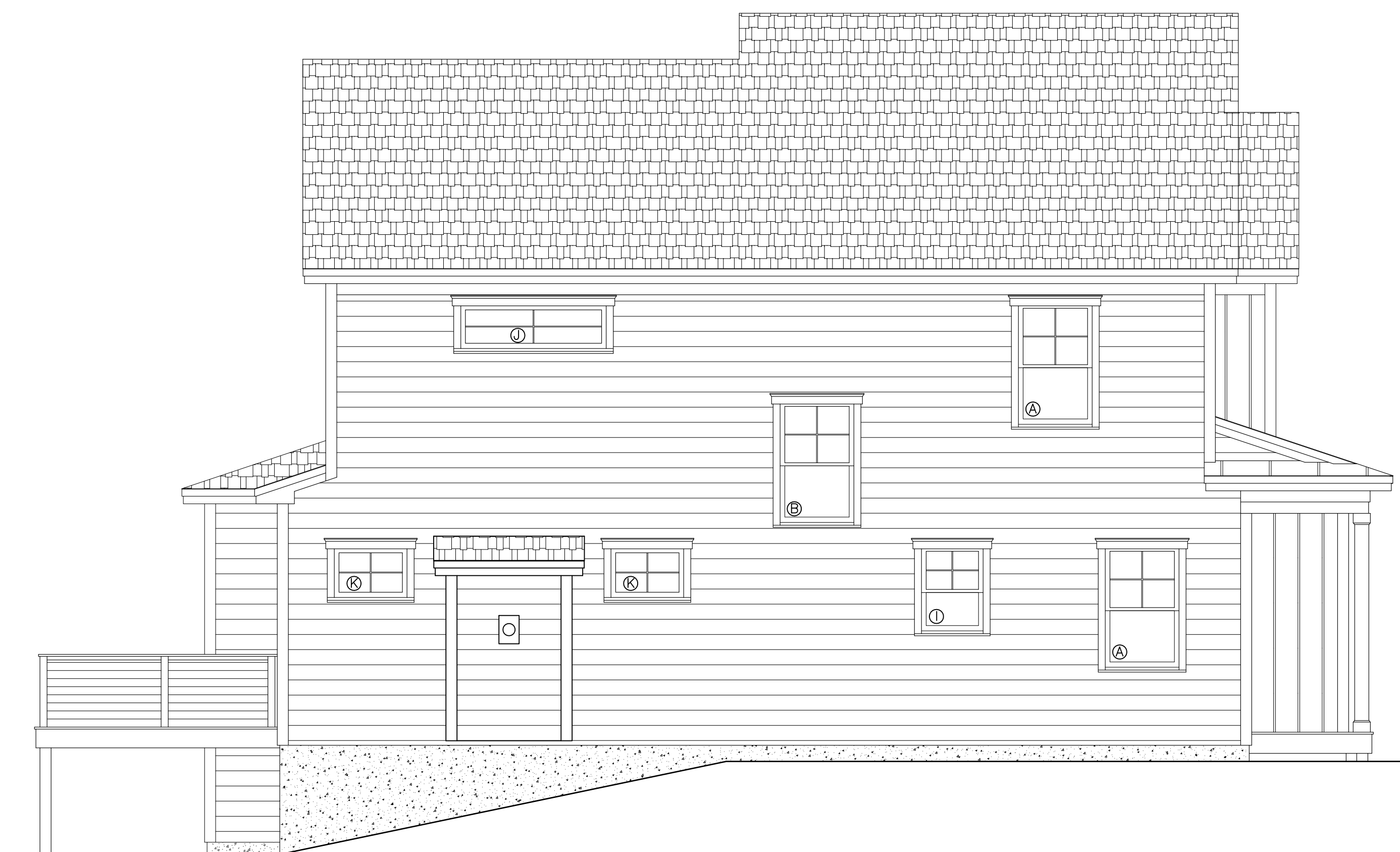
2 LEFT SIDE ELEVATION 1/4" = 1'-0"