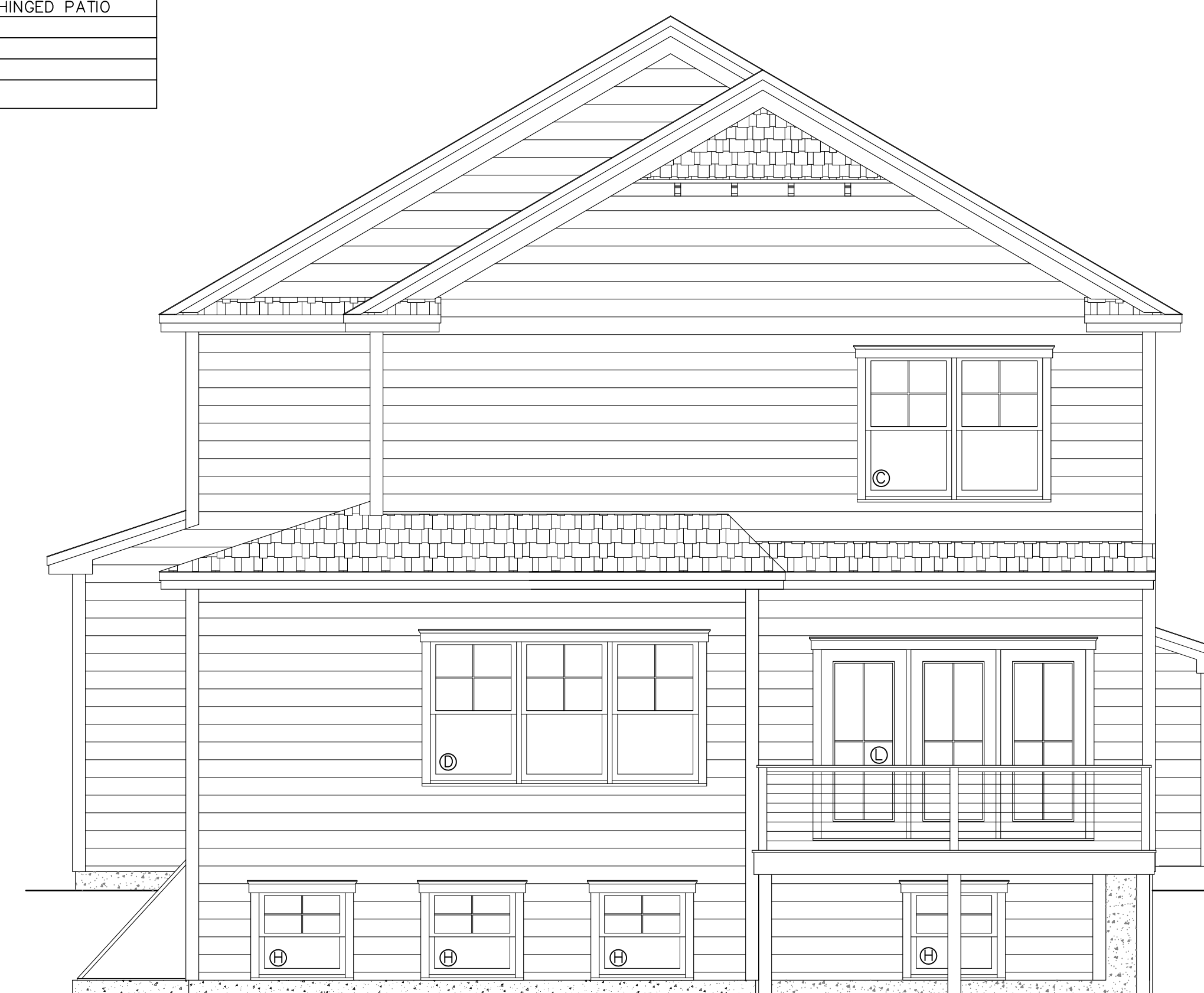
4 REAR ELEVATION 1/4" = 1'-0"