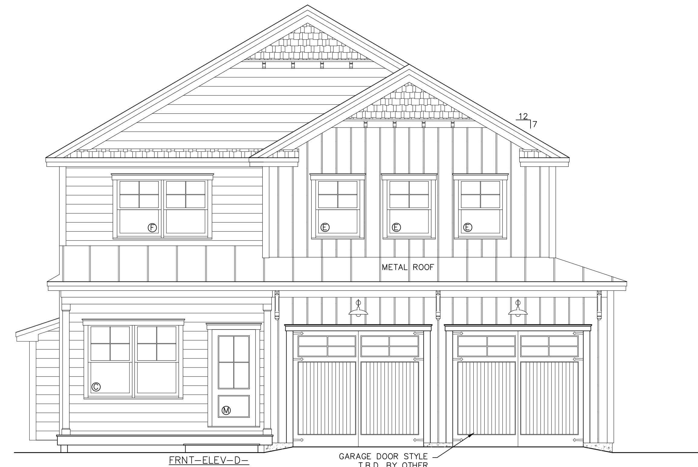
1 FRONT ELEVATION 1/4" = 1'-0"