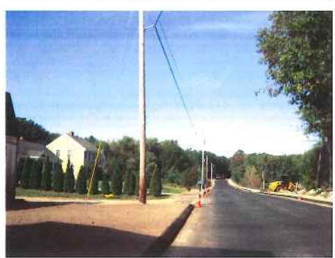
Abutting homes on Ledgewood

A sidewalk on the north side (opposite the development site), and curbs on both sides, of Ledgewood Drive have recently been constructed by Falmouth, though it is understood there are no immediate plans for similar improvements in Ocean Ave/Middle Road.