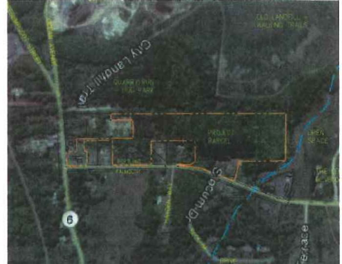
Extract from applicant's submission; see also Plan 2

The Planning Board is being requested to review the application under Portland's Subdivision Ordinance. The required waivers are still under discussion but include sidewalks/curbing, and aspects of street design.