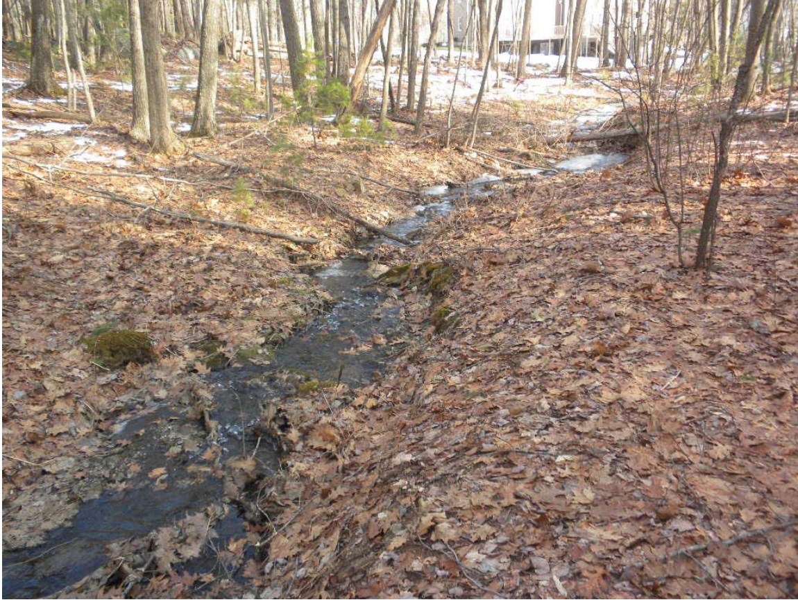
Photograph taken by Peter Biegel (Land Design Solutions) February 1, 2013

Ledgewood Drive, Falmouth Maine NRPA PBR – Culvert Crossing Site Photograph