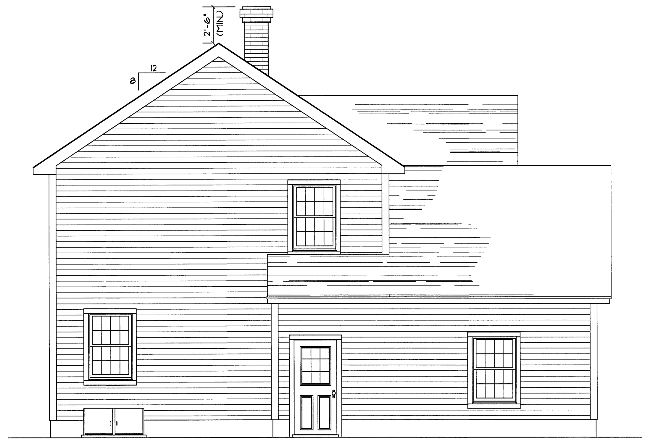
LEFT ELEVATION SCALE: 1/4" = 1'-0"