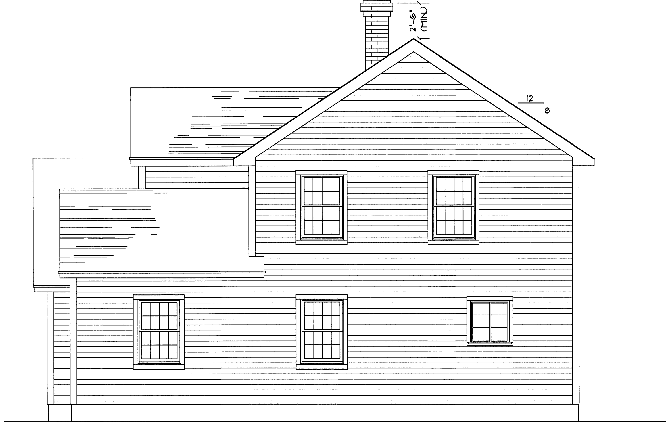
RIGHT ELEVATION SCALE: 1/4" = 1'-0"