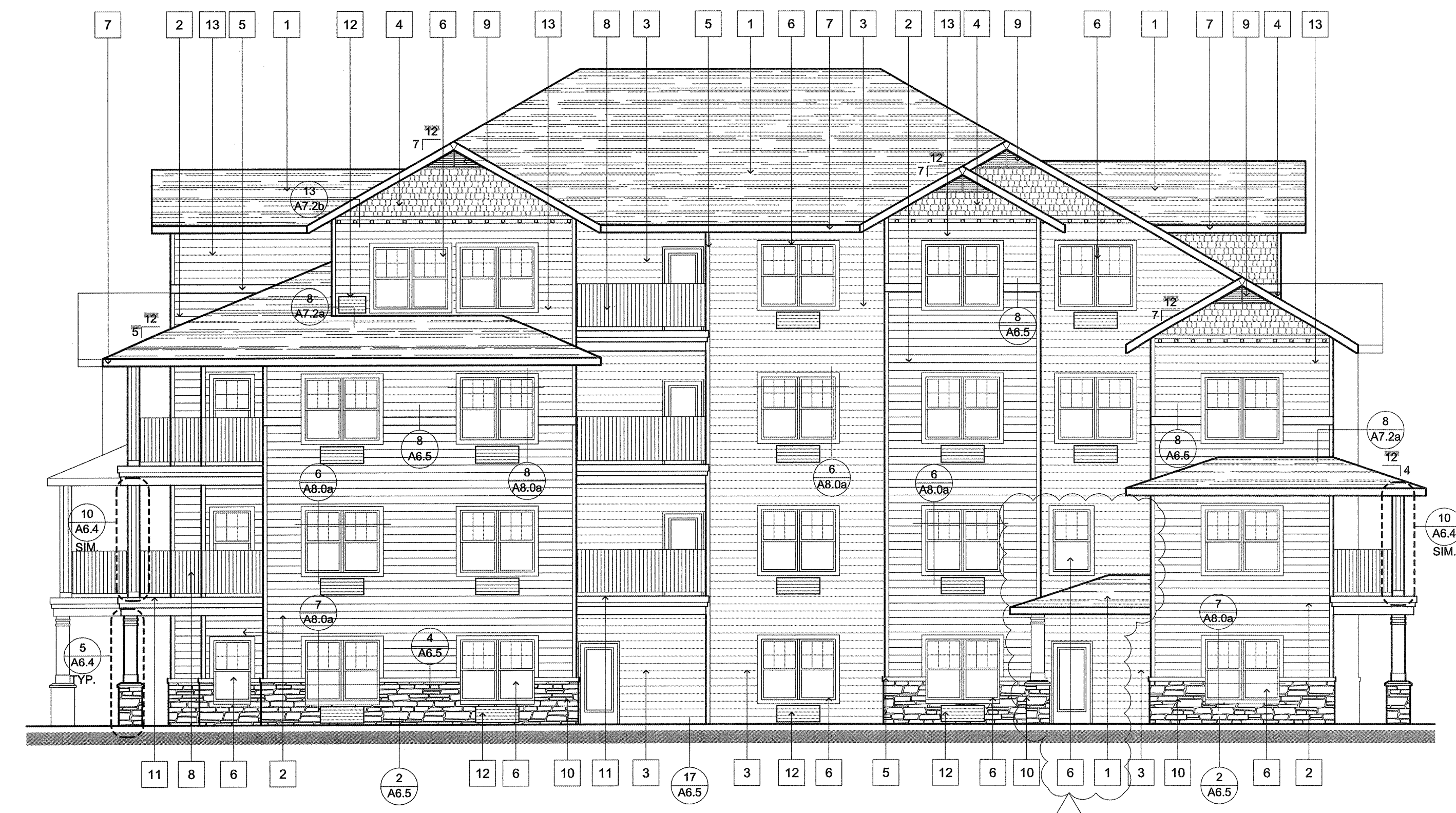
C SIDE ELEVATION SCALE: 1/8"=1'-0" (TYP. ALL DWG'S THIS SHEET U.O.N.)