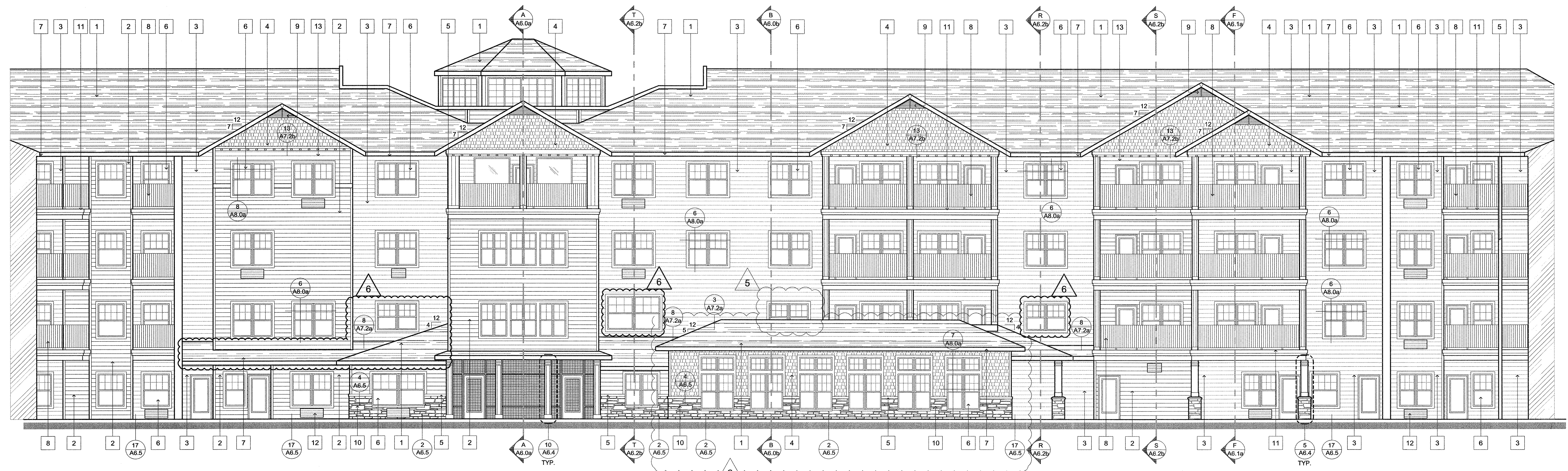
B REAR ELEVATION SCALE: 1/8"=1'-0" (TYP. ALL DWG'S THIS SHEET U.O.N.)

DATE 8/28/2015 REVISED DATE 2/2/2016 SHEET A6.3b