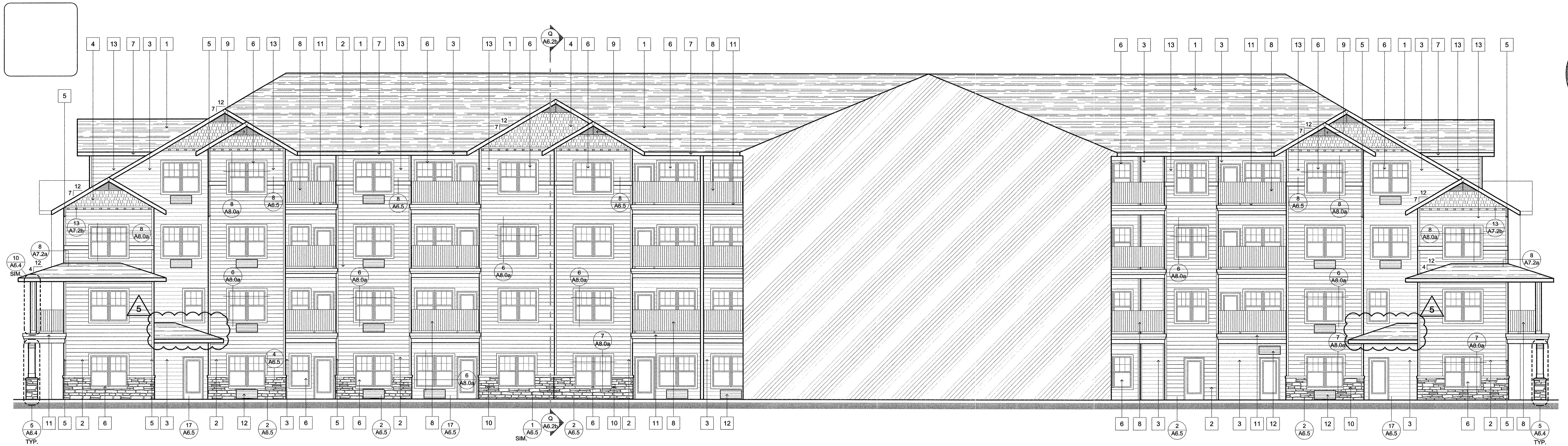
F SIDE ELEVATION SCALE: 1/8"=1'-0" (TYP. ALL DWG'S THIS SHEET U.O.N.)