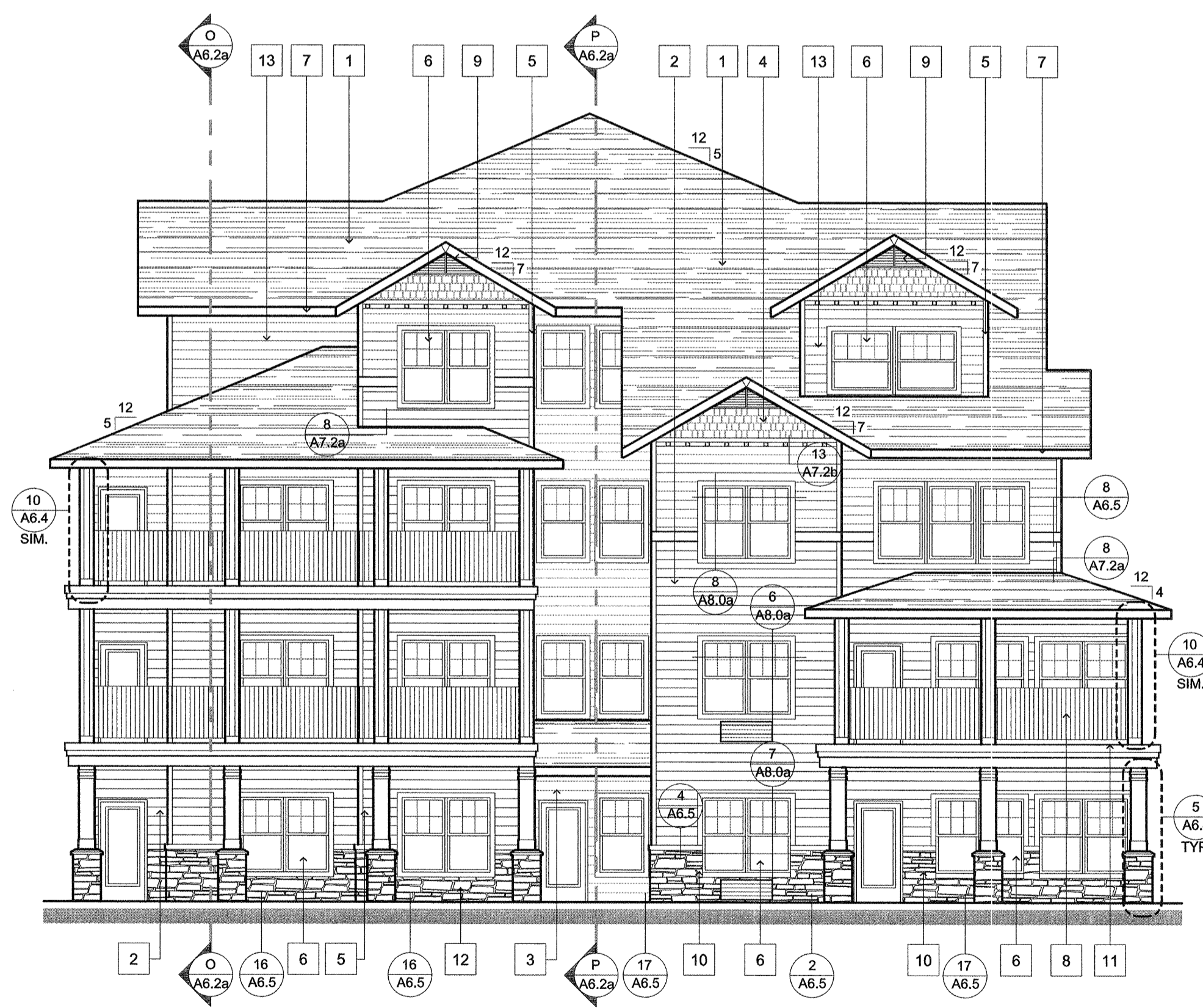
H WING END ELEVATION SCALE: 1/8"=1'-0" (TYP. ALL DWG'S THIS SHEET U.O.N.)

NOTE: WRAP ENTIRE EXTERIOR OF BUILDING WITH BLDG PAPER. ALL JOINTS TO BE TAPED WITH SHEATHING TAPE. SYSTEM MUST BE INSTALLED IN ACCORDANCE WITH MANUF. INSTALLATION INSTRUCTIONS TO PROVIDE 10 YR. WARRANTY TO GENERAL CONTRACTOR