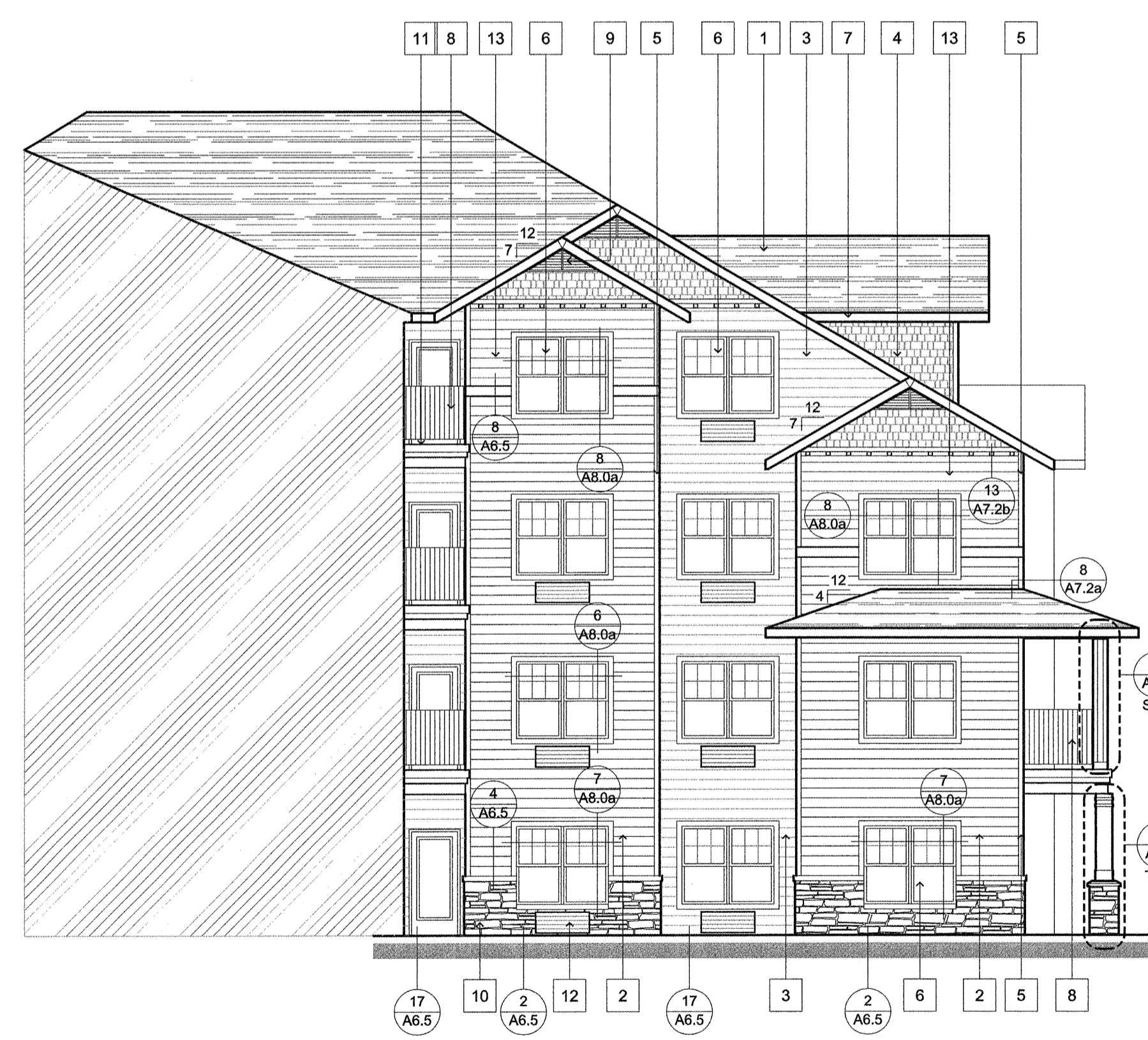
G SIDE ELEVATION SCALE: 1/8"=1'-0" (TYP. ALL DWG'S THIS SHEET U.O.N.)