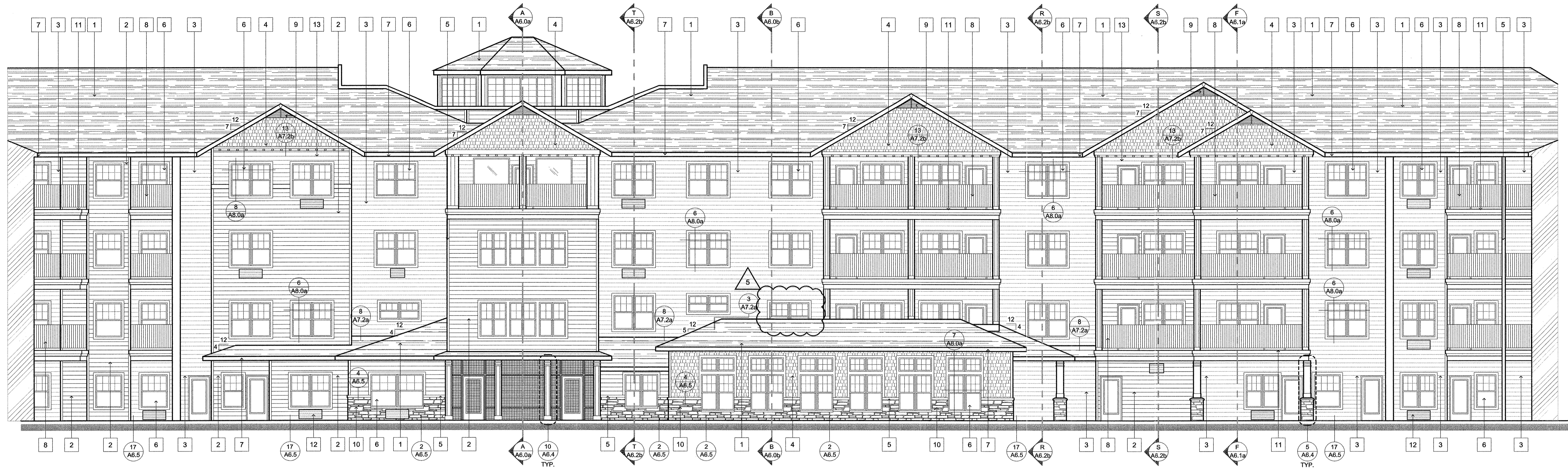
B REAR ELEVATION SCALE: 1/8"=1'-0" (TYP. ALL DWG'S THIS SHEET U.O.N.)