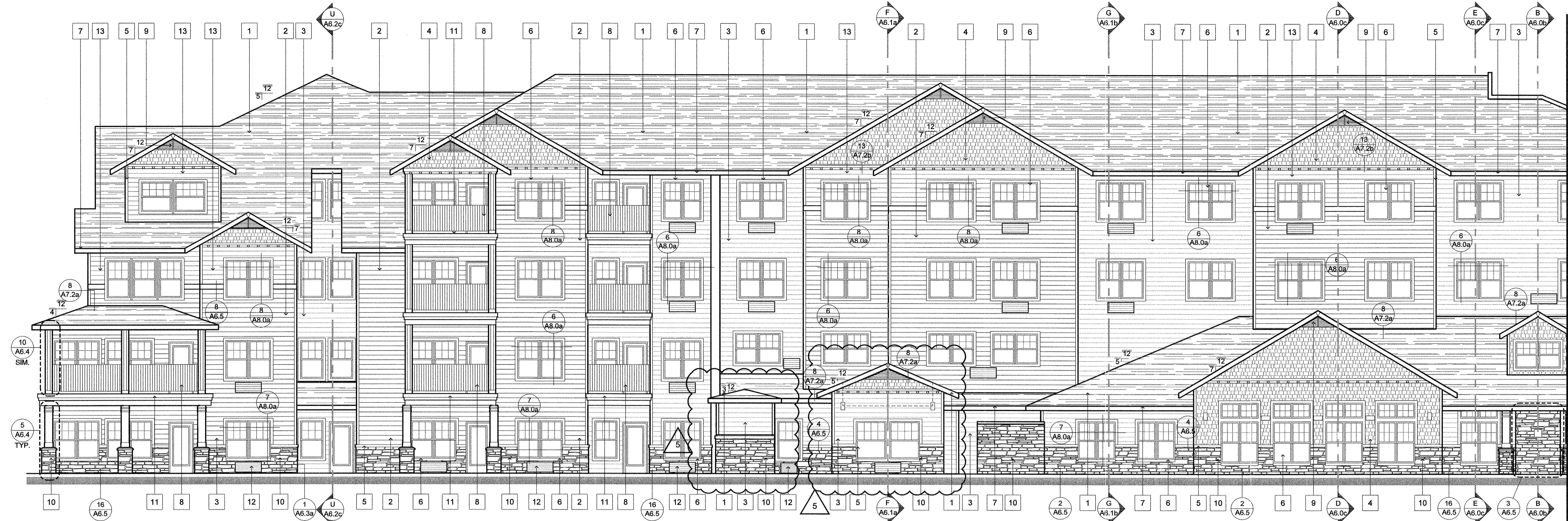
A FRONT ELEVATION SCALE: 1/8"=1'-0" (TYP. ALL DWG'S THIS SHEET U.O.N.)