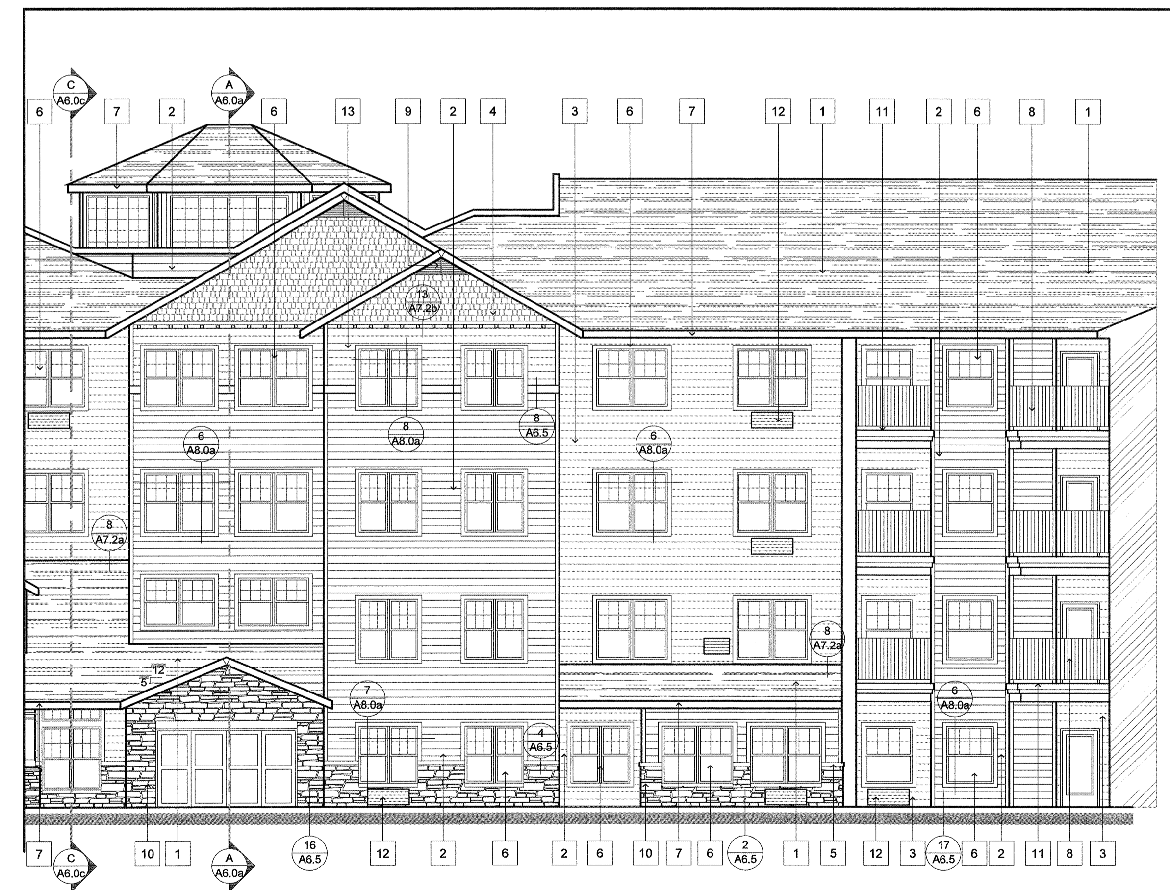
A FRONT ELEVATION SCALE: 1/8"=1'-0" (TYP. ALL DWG'S THIS SHEET U.O.N.)

NOTE: WRAP ENTIRE EXTERIOR OF BUILDING WITH BLDG PAPER. ALL JOINTS TO BE TAPED WITH SHEATHING TAPE. SYSTEM MUST BE INSTALLED IN ACCORDANCE WITH MANUF. INSTALLATION INSTRUCTIONS TO PROVIDE 10 YR. WARRANTY TO GENERAL CONTRACTOR