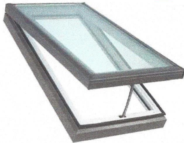
Manual "Fresh Air" curb mounted No Leak Skylight - VCM