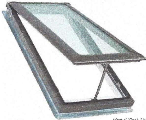
Manual "Fresh Air" deck mounted No Leak Skylight - VS