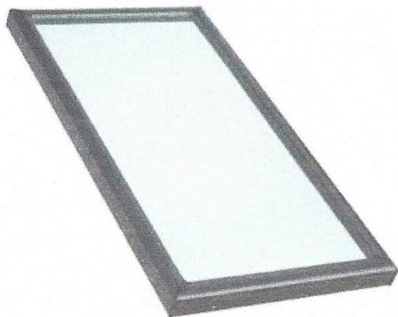
Fixed curb mounted No Leak Skylight - FCM