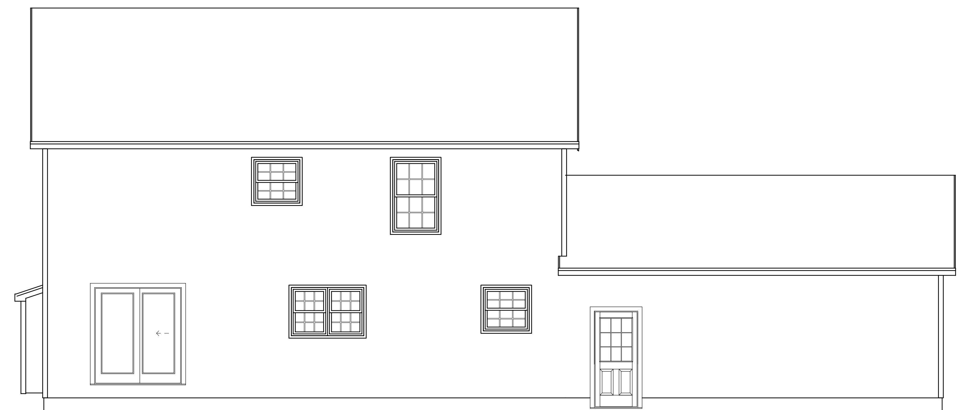
REAR ELEVATION 1/4" = 1'-0"

CONSTRUCTION NOTE: CONTRACTOR IS TO VERIFY GRADE AND ALL DIMENSIONS IN FIELD BEFORE CONSTRUCTION. SECTION SHOWN MAY DIFFER FROM ACTUAL FINISHED CONSTRUCTION. FINAL MATERIALS, WINDOW/DOOR LOCATIONS AND SIZES, TO BE DETERMINED PER OWNER/CONT. SITE CONDITIONS, AND OR LOCAL CODES.