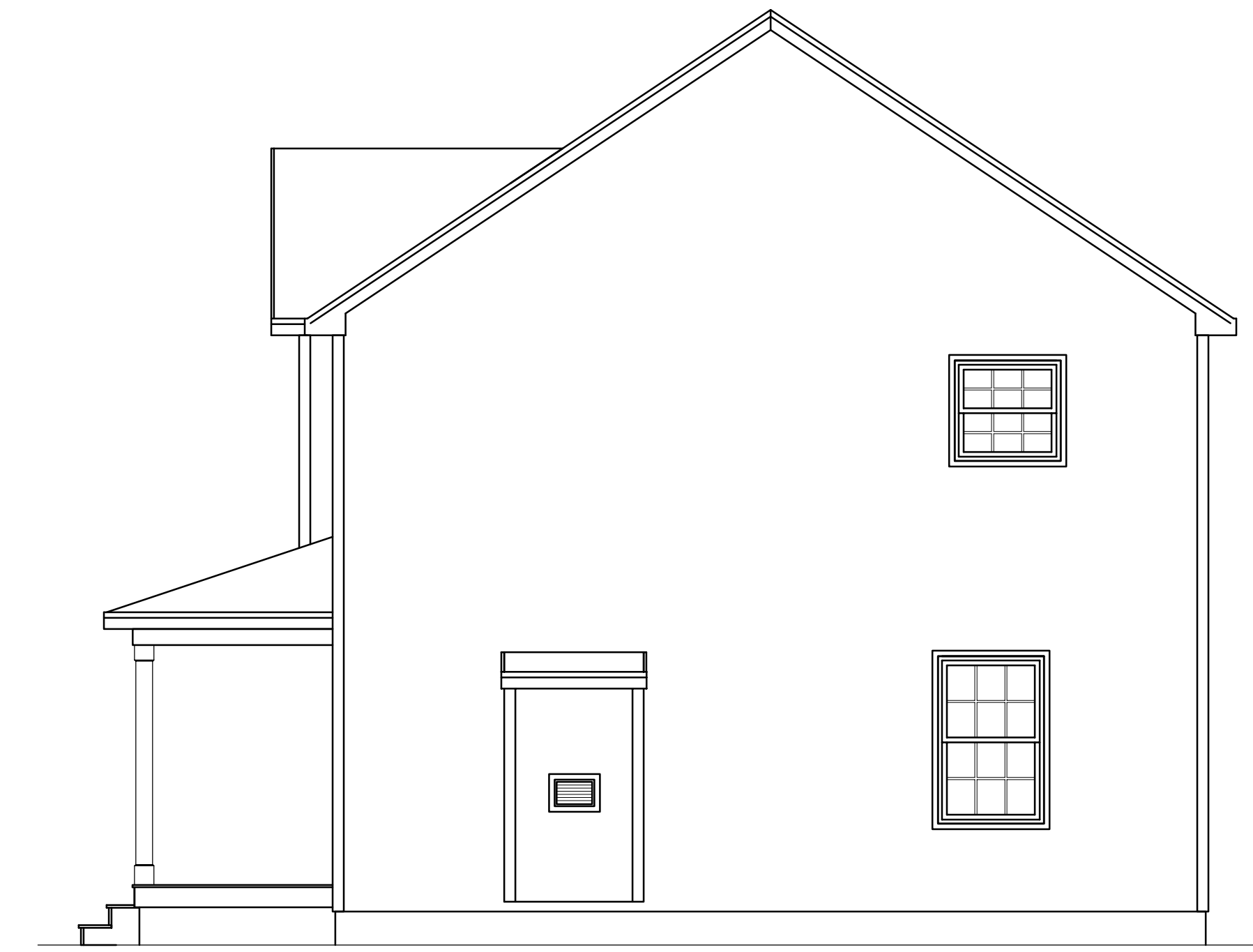
RIGHT ELEVATION 1/4" = 1'-0"

CONSTRUCTION NOTE: CONTRACTOR IS TO VERIFY GRADE AND ALL DIMENSIONS IN FIELD BEFORE CONSTRUCTION. SECTION SHOWN MAY DIFFER FROM ACTUAL FINISHED CONSTRUCTION. FINAL MATERIALS, WINDOW/DOOR LOCATIONS AND SIZES, TO BE DETERMINED PER OWNER/CONT. SITE CONDITIONS, AND OR LOCAL CODES.