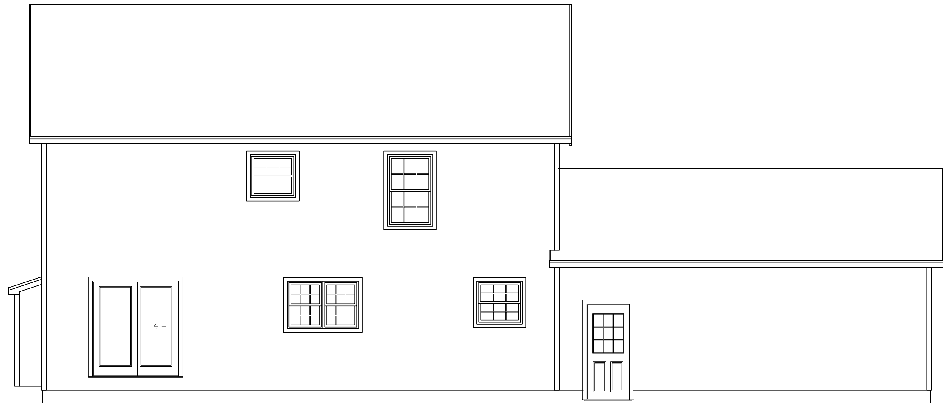
REAR ELEVATION 1/4" = 1'-0"

CONSTRUCTION NOTE: CONTRACTOR IS TO VERIFY GRADE AND ALL DIMENSIONS IN FIELD BEFORE CONSTRUCTION. SECTION SHOWN MAY DIFFER FROM ACTUAL FINISHED CONSTRUCTION. FINAL MATERIALS, WINDOW/DOOR LOCATIONS AND SIZES, TO BE DETERMINED PER OWNER/CONT. SITE CONDITIONS, AND OR LOCAL CODES.