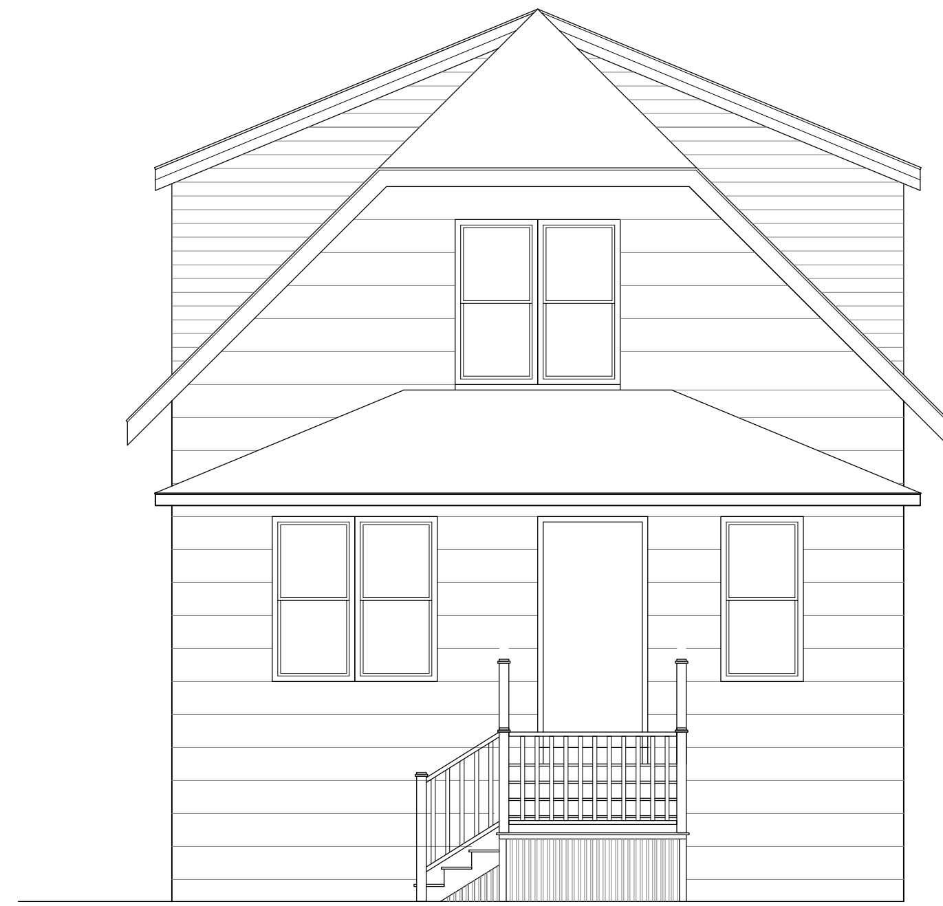
EXISTING STREET ELEVATION Scale: 1/4" = 1'-0"