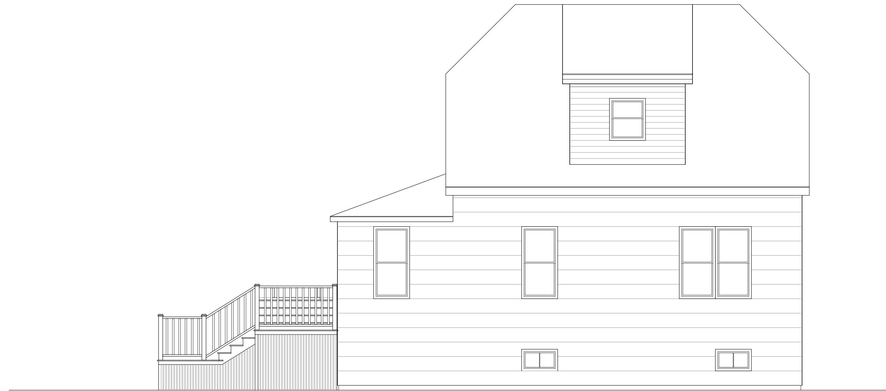
EXISTING RIGHT ELEVATION Scale: 1/4" = 1'-0"