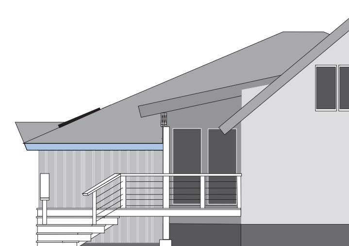
EAST SIDE (BACK)