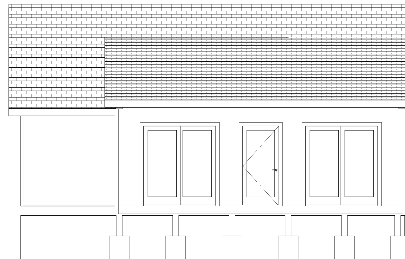
REAR ELEVATION SCALE: 1/4" = 1'0"

IMPORTANT NOTES: ALL DIMENSIONS MUST BE CONFIRMED BY THE CONTRACTOR/BUILDER. ALL DIMENSIONS ARE TO FACE UNLESS OTHERWISE NOTED. AND CORERS TO BE 90 DEGREES UNLESS OTHERWISE NOTED. AND REMAIN THE PROPERTY OF THE ARCHITECT. NO PART OF THIS DOCUMENT IS TO BE REPRODUCED OR TRANSMITTED IN ANY FORM OR BY ANY MEANS, ELECTRONIC OR MECHANICAL, INCLUDING PHOTOCOPYING, RECORDING, OR BY ANY INFORMATION SYSTEM. ALL RIGHTS RESERVED.